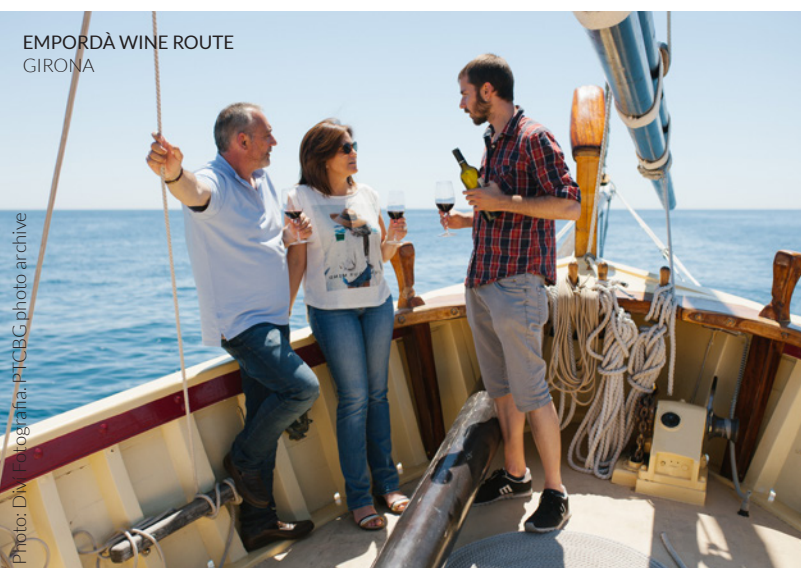
EMPORDÀ WINE ROUTE GIRONA