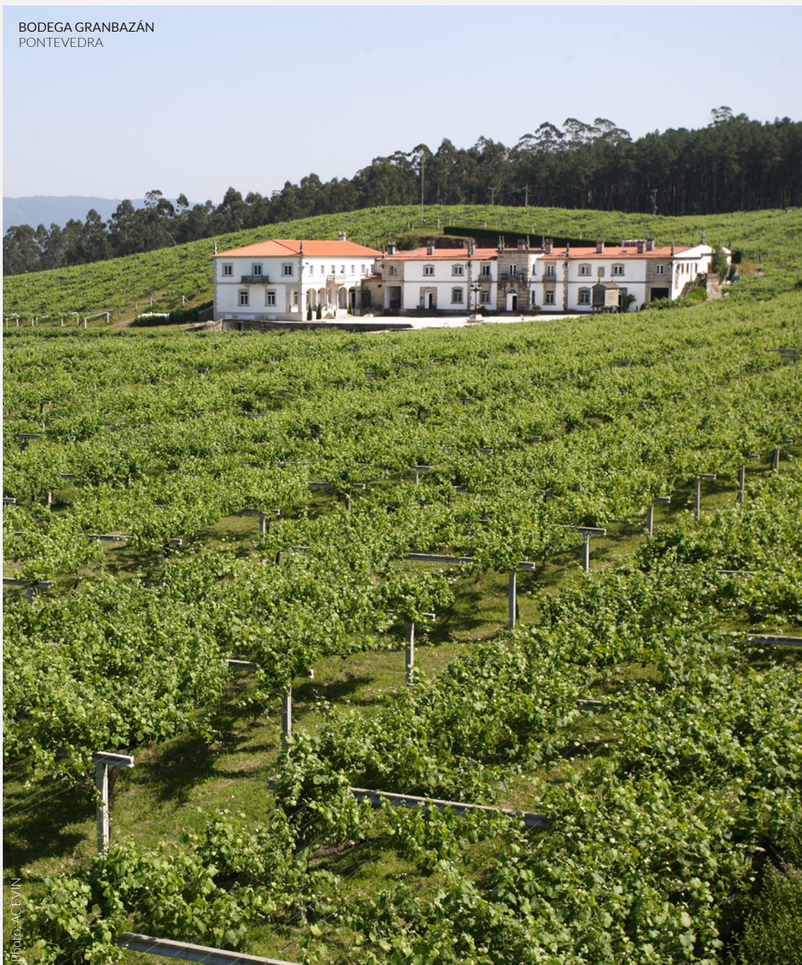
BODEGA GRANBAZÁN PONTEVEDRA

Allow yourself to be enveloped in the colours of this area's landscape. Here you'll find some of the most prestigious wine-producing areas. La Rioja, the Basque Country, Catalonia and Galicia offer numerous routes where you can experience world-class gastronomy and the expertise of the winery owners.