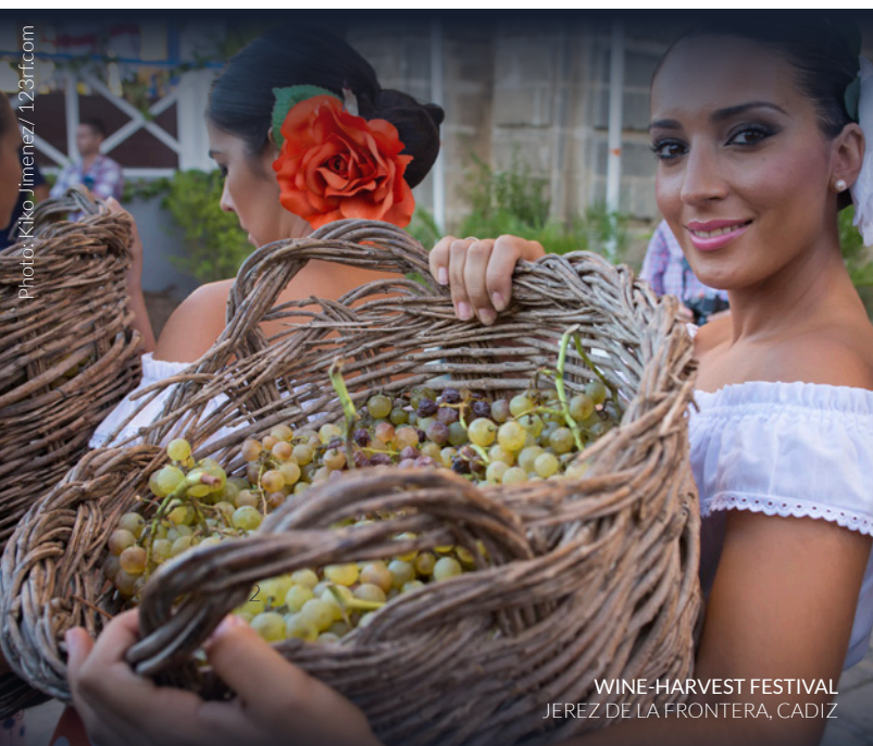
WINE-HARVEST FESTIVAL JEREZ DE LA FRONTERA, CADIZ