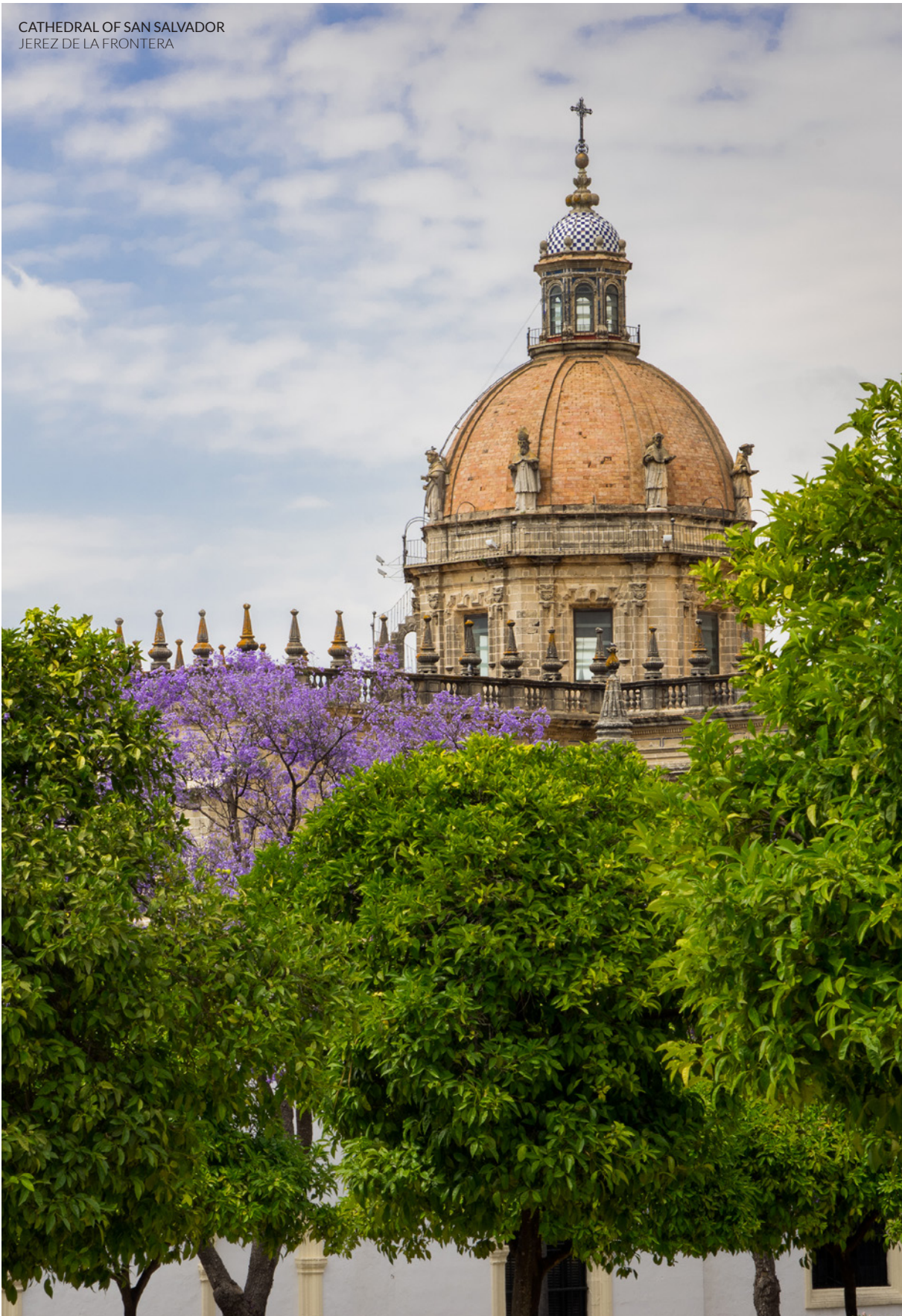
CATHEDRAL OF SAN SALVADOR JEREZ DE LA FRONTERA