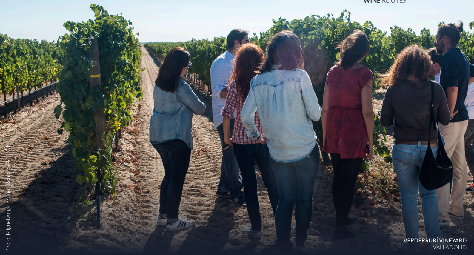
VERDERRUBÍ VINEYARD VALLADOLID