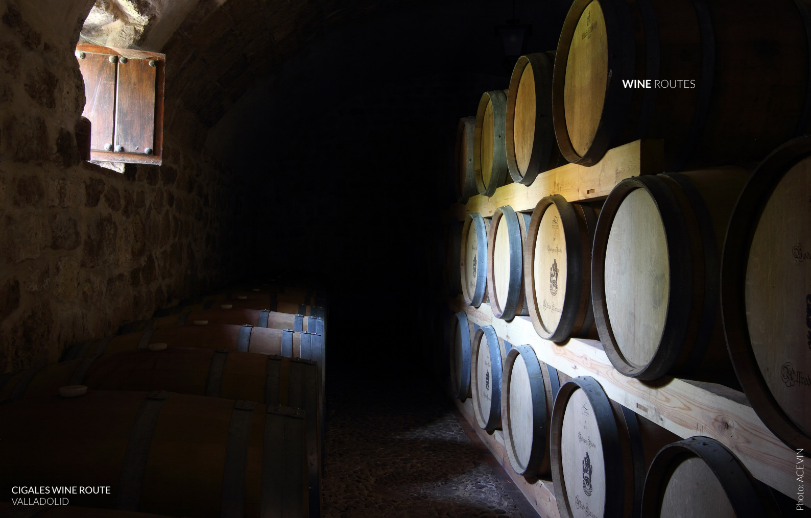
CIGALES WINE ROUTE VALLADOLID