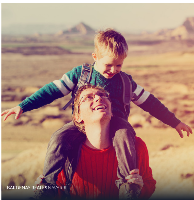
BARDENAS REALES NAVARRE