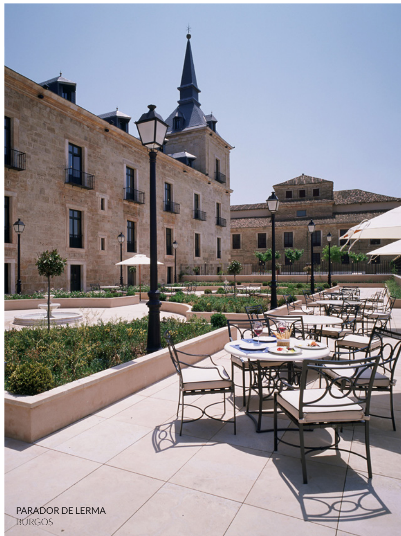
PARADOR DE LERMA BÚRGOS

Spain provides an opportunity to discover delicious wines and work, and have pleasure and fun in historic wineries with ancestral underground cellars where wines are made following traditional practices. You'll find perfectly equipped halls in avant-garde buildings designed by some of the world's greatest architects. Seductive contrasts of old and new where you can enjoy a unique experience amid vineyards and wineries.