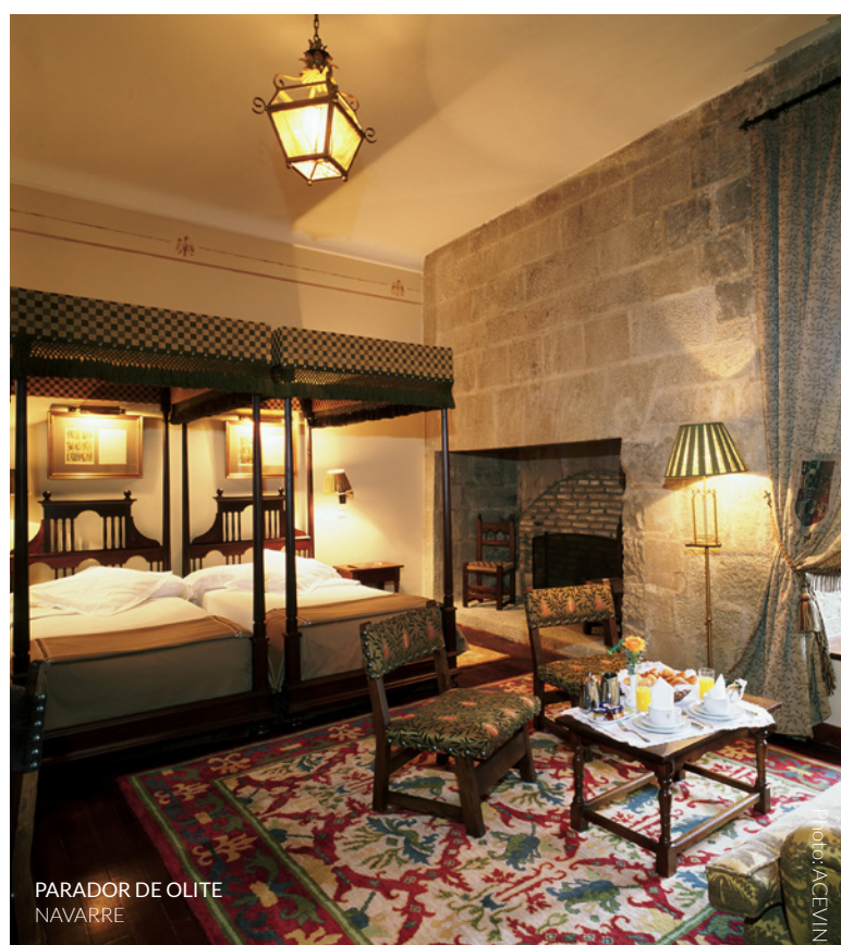
PARADOR DE OLITE NAVARRE

Enjoy a few unforgettable days as you recharge your batteries in any of Spain's Parador hotels . The excellence of their cuisine and the variety of services are a guarantee of quality and comfort. Some of them are part of the wine routes that criss-cross the Spanish mainland. In La Rioja you can stay in the Parador de Olite , housed in a mediaeval palace in Olite, La Rioja. If you're heading for the Ribera del Duero, seize the chance to spend a couple of nights in the Parador de Lerma . The modern Parador de Cadiz is perfect for exploring the brandy route in Jerez, with an exclusive swimming pool and attractive facilities.