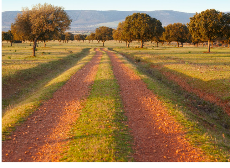
CABAÑEROS NATIONAL PARK TOLEDO