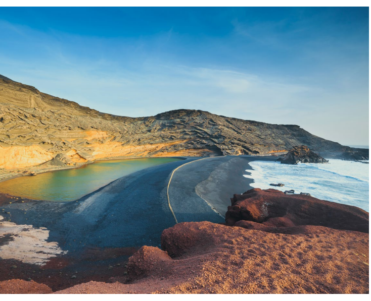
▲ CHARCO DE LOS CLICOS LANZAROTE

Discover the relationship between the inhabitants and their unique natural environment and explore the footprint left by the architect César Manrique on the island and the significance of his ecological message. Most of his works are to be found in Lanzarote, including the renowned César Manrique Foundation. Discover the perfect harmony between art and the landscape, where respect for the environment is what is most important.