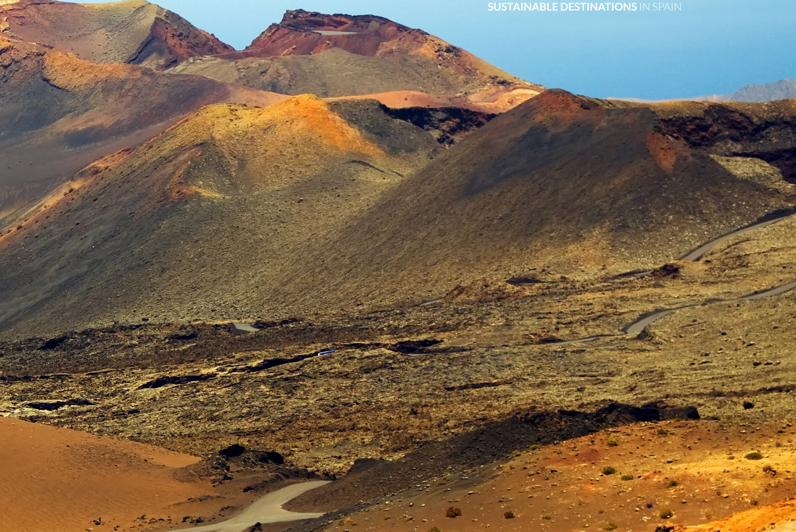
TIMANFAYA NATIONAL PARK LANZAROTE