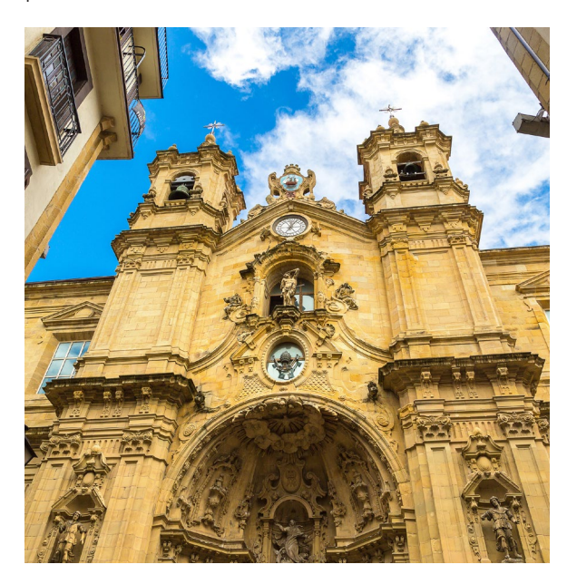
▲ BASILICA OF SANTA MARÍA DEL CORO

with trees. You can admire Buen Pastor Cathedral, Teatro Victoria Eugenia Theatre and the City Hall, which is a stunning building that played host to the city's casino until gambling was prohibited in 1924.