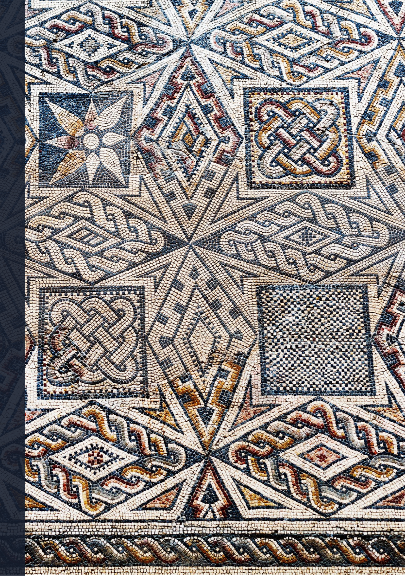
ROMAN MOSAIC NATIONAL MUSEUM OF ROMAN ART (MÉRIDA)

In Extremadura you'll see cornfields, vineyards and pastures. You'll be astonished by the historic quarter in Cáceres and the Merida archaeological complex, both designated as World Heritage sites by the UNESCO. The province of Cáceres awaits you with the picturesque town of Hervás, renowned for its Jewish guarter with steep, narrow streets, and Plasencia, which features a monumental complex with two cathedrals and a number of palaces and stately houses. The Iberian cured ham is delicious in Extremadura, one of the best in the country, and the Roman spa of Baños de Montemayor is a perfect place for you to relax.