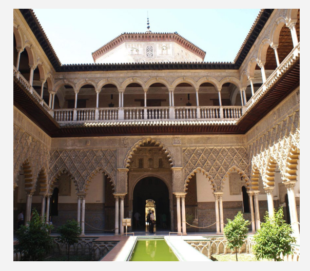
▲ PATIO DE LAS DONCELLAS IN THE REAL ALCAZAR IN SEVILLE SEVILLE

Belmonte Castle in Cuenca is a treasure from the Renaissance. It is in the shape of a six-pointed star with a cylindrical tower at each point. If you visit it in May/June, you'll be able to witness a historical re-enactment of Medieval military life in the castle in all its aspects.