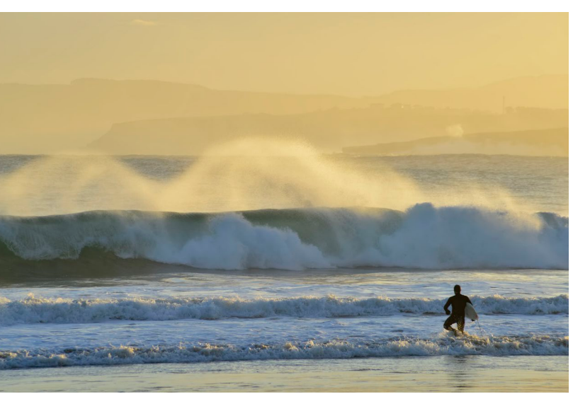
▲ LAREDO CANTABRIA

Follow in the footsteps of Charles V after he abdicated in Brussels. The monarch arrived in the North of Spain with more than 50 ships and journeyed through Cantabria , Castile-León and Extremadura before reaching his retreat in the Yuste Monastery .