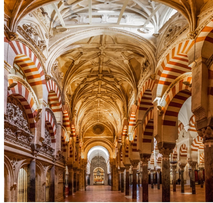
GREAT MOSQUE-CATHEDRAL OF CORDOBA CÓRDOBA

In Segovia, whose old town and aqueduct are UNESCO World Heritage sites, you can take a stroll through the delightfully restored Jewish quarter. Here you'll find the old Great Synagogue which has now become the Church of Corpus Christi, and the old Jewish cemetery.