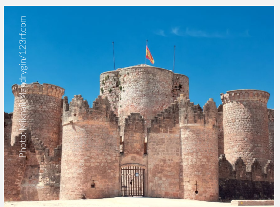
BELMONTE CASTLE CUENCA

Mota Castle in Valladolid, Loarre Castle in Huesca, Almodóvar del Río Castle in Córdoba... There are incredible castles scattered all over the Spanish mainland. Just ask in any tourist office, each autonomous region has its own route.