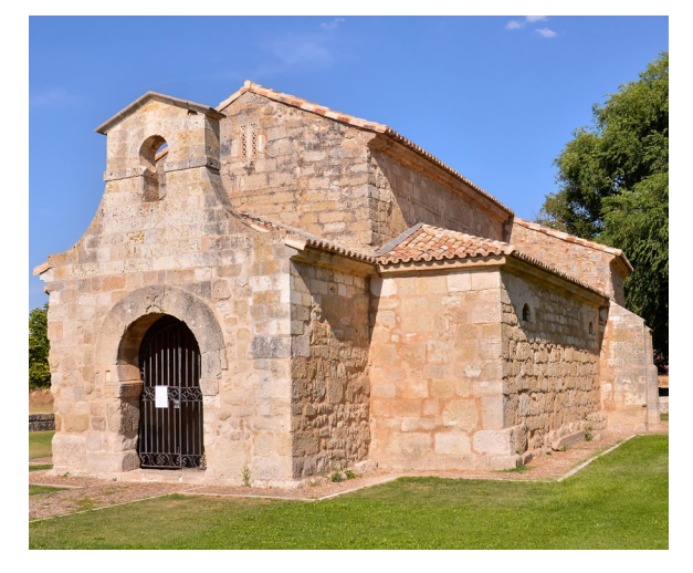
CHURCH OF SAN JUAN DE BAÑOS VENTA DE BAÑOS (BURGOS)