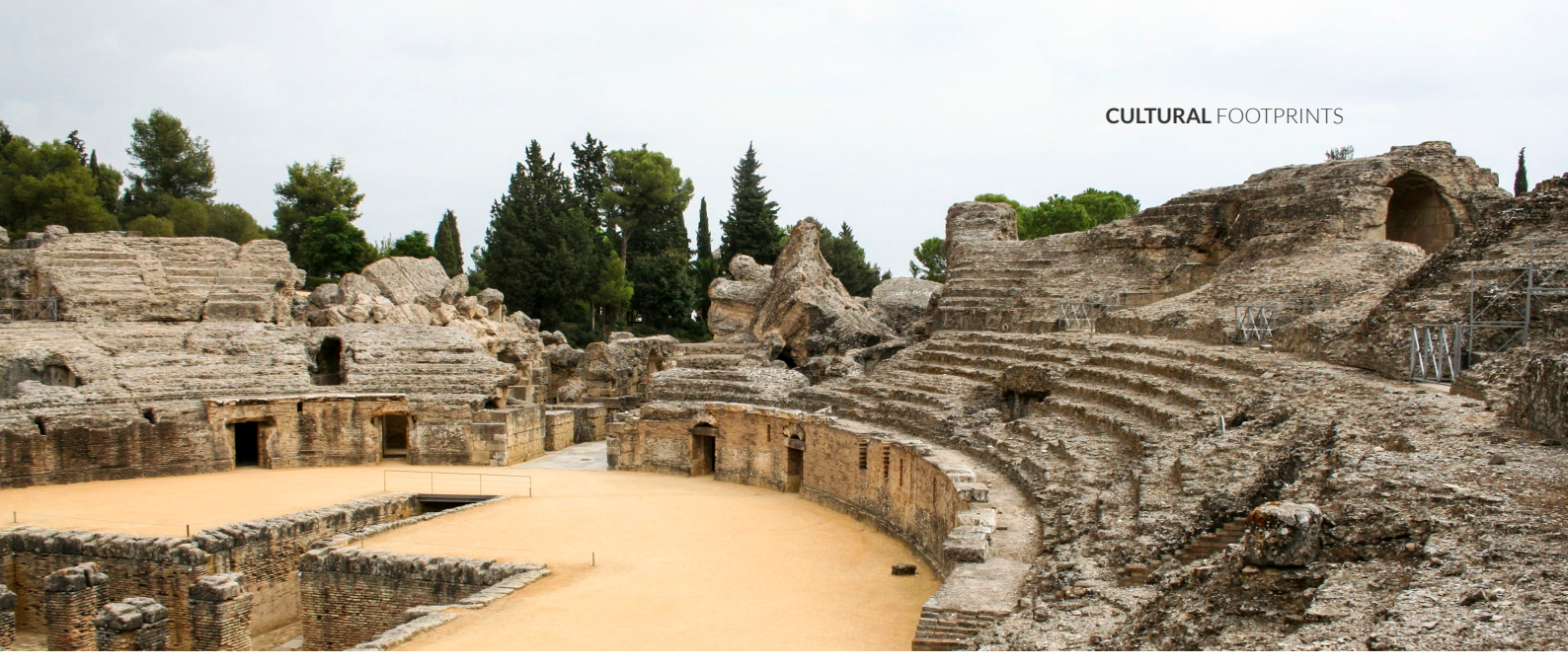
ROMAN AMPHITHEATRE IN ITÁLICA SANTIPONCE (SEVILLE)

On the Route of the Almoravids and Almohads you'll discover the architectural heritage of this civilisation which consists mainly of castles and defensive structures. You'll travel 400 kilometres, starting in the city of Algeciras (Cádiz) and ending in Granada , including the two branches. The itinerary includes visits to Jerez de la Frontera (Cádiz) and Ronda (Málaga).