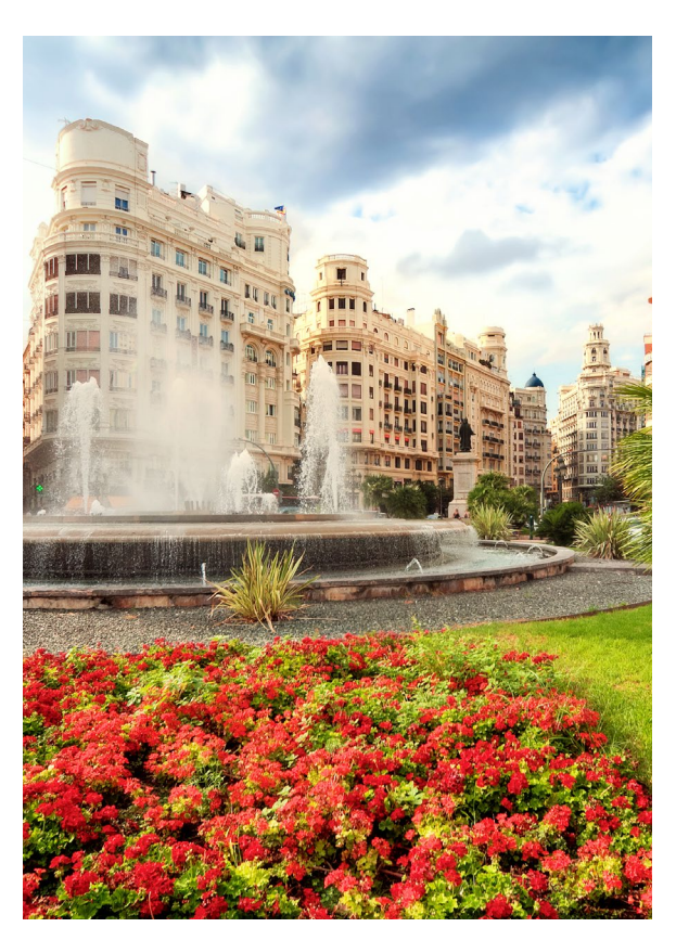
PLAZA DEL AYUNTAMIENTO SQUARE

If you like crafts, try Plaza Redonda market, in the El Mercat neighbourhood, and come away with some souvenirs.