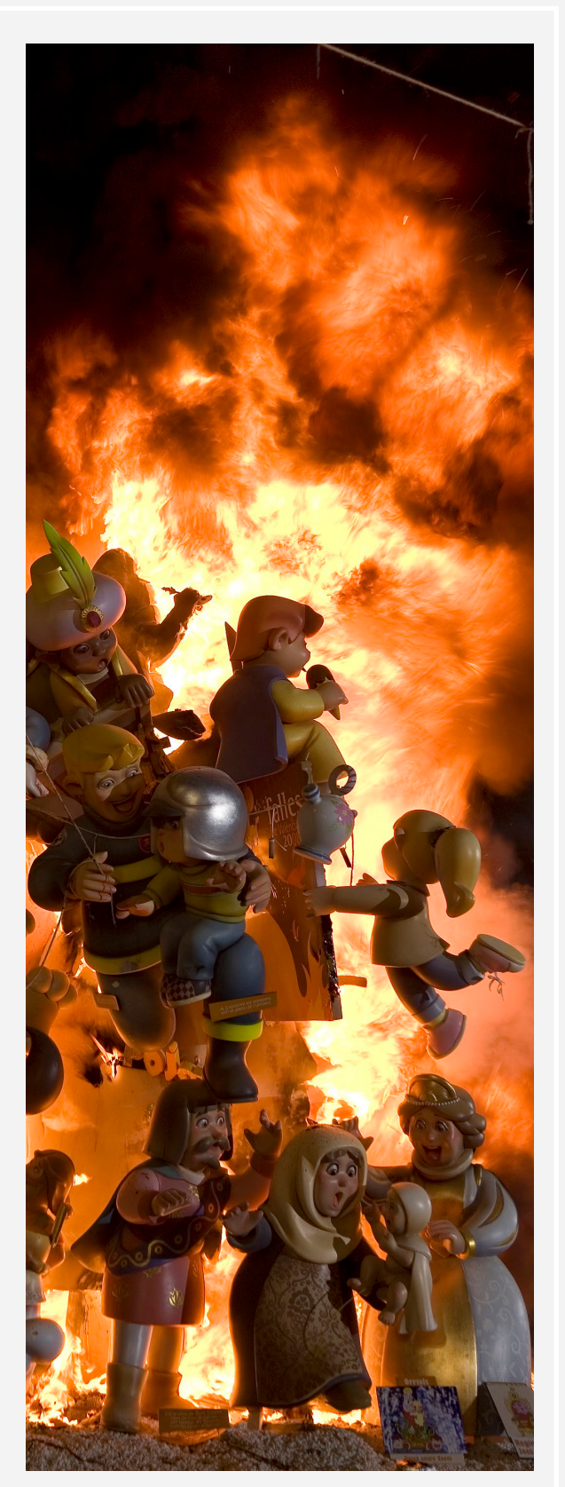
LAS FALLAS BONFIRE FESTIVAL

Do you want to discover Valencian folklore? Don't miss the traditional dansà that takes place on the evening of the second Sunday in May as part of the festival of the Virgin of Los Desam parados , the patron saint of Valencia.