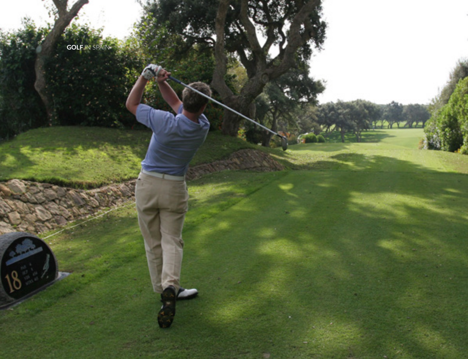
▲ REAL CLUB DE VALDERRAMA CÁDIZ