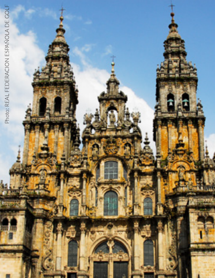
▲ SANTIAGO CATHEDRAL SANTIAGO DE COMPOSTELA