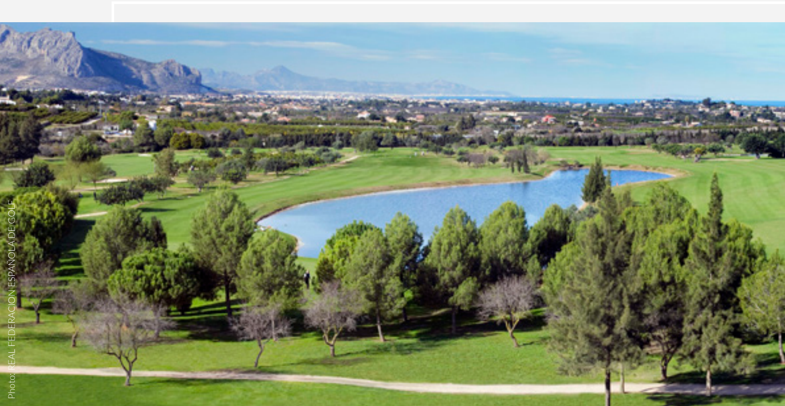
▲ SELLA GOLF RESORT &amp; SPA, DENIA

Along the Cantabrian coast, Green Spain, there are all kinds of golf courses. You'll also find Michelin-starred restaurants throughout Galicia, Cantabria, Asturias and the Basque Country. Just five minutes from the centre of Donostia-San Sebastián, in mountainous surroundings, the Real Nuevo Club Golf de San Sebastián Basozabal has one of the most demanding courses in the country. There is a restaurant with a terrace where you can try the exquisite local cuisine while enjoying magnificent panoramic views of the surrounding countryside. If it's haute cuisine you're looking for, then you really should try the Martín Berasategui, Akelarre and Arzak Restaurants, each one with three Michelin stars.