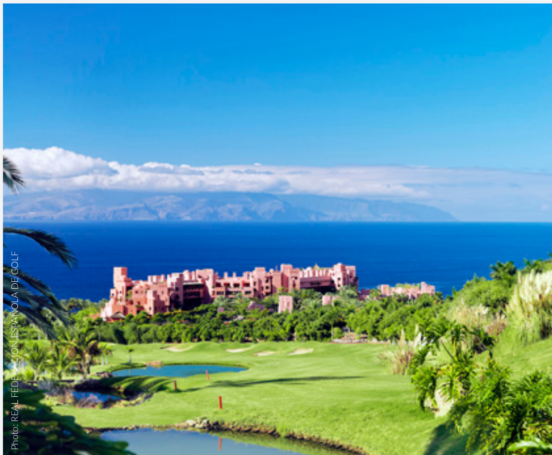
▲ ABAMA GOLF, GUÍA DE ISORA TENERIFE

We suggest you blend two passions, golf and good food. A fun and savoury way to discover our cuisine and new ways of improving your handicap .