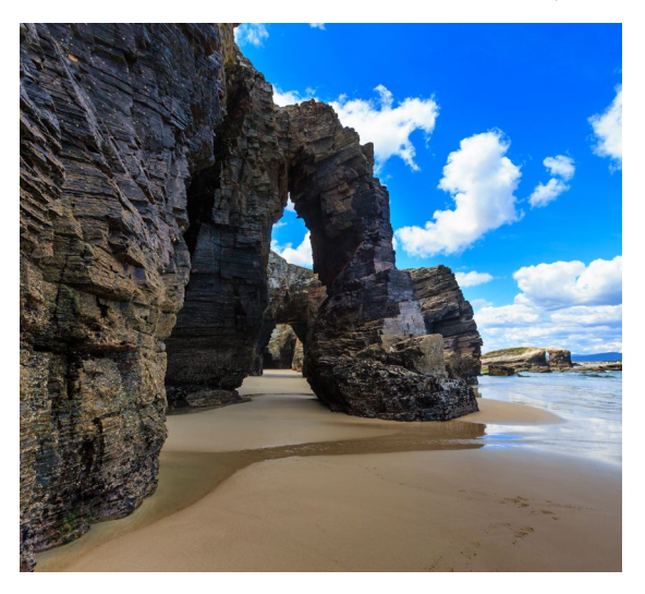
► LAS CATEDRALES BEACH RIBADEO, LUGO

one of the best in the world. This is a landscape that extends as far as the Green Coast that runs along the whole of the coastline of Asturias. More towards the west, the steeply sloping Cantabrian Coast has as many as 90 beaches, many of them isolated and ideal for a plunge. The journey ends at the Basque Coast , where you'll find endless stretches of sand, surfing paradises and legendary urban beaches such as La Concha in San Sebastián.