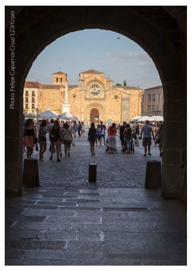
PLAZA DE SANTA TERESA ÁVILA

Then there is the garden of Moshé de León whose architecture reminds us of the structure of a mystical garden. Spirituality also has a strong presence in the Mysticism Visitor Centre, a unique place where Ávila's connection with the spiritual quest is explained.