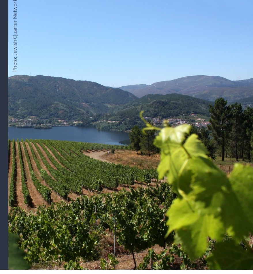
RIBADAVIA VINEYARD OURENSE

The Network of Jewish Quarters is promoting a number of projects regarding the essence of the Sephardic tradition in Spain.