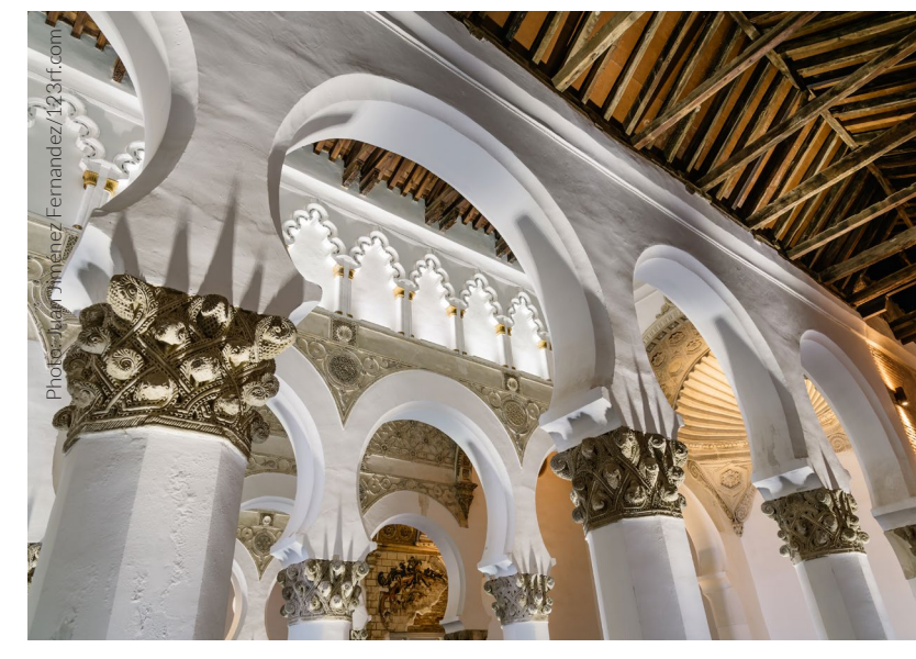
SYNAGOGUE OF SANTA MARÍA LA BLANCA TOLEDO

The north patio of the Sephardic Museum has a permanent exhibit, the Jardín Sonoro or Sound Garden, which recreates the sounds of street life in the old Toledo Jewish Quarter. Voices speaking Ladino (the language spoken by Spanish Jews before being deported from Spain) and street sounds creating a Sephardic melody recreating the experience of a stroll through medieval Toledo's Jewish Quarter.