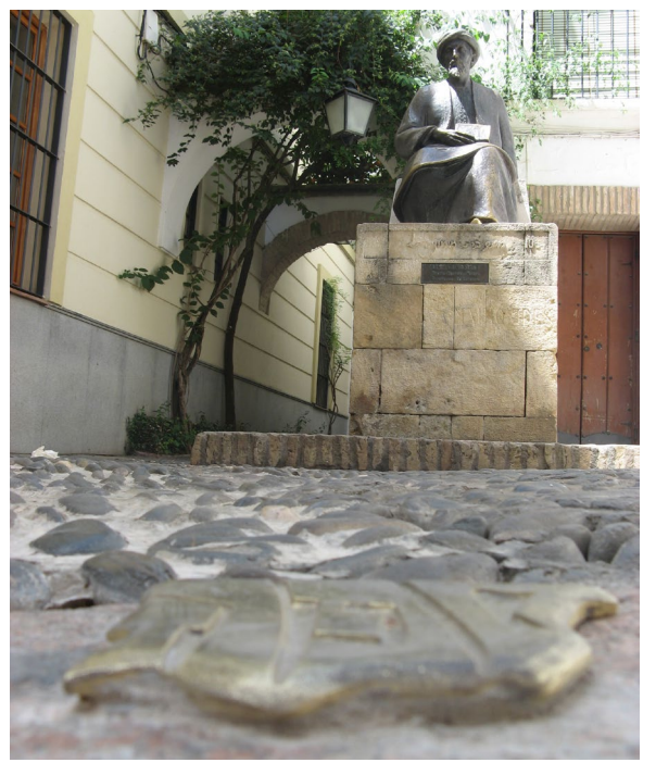
SEPHARAD HOUSE CÓRDOBA

Visit the Municipal Craft Bazaar, a market where Cordobese craftsmen display their works in silver, pottery and leather. In May, to coincide with the popular Festival of the Córdoba Patios, which has been declared Intangible Cultural Heritage, there are performances of "cante jondo" (traditional Flamenco singing) in the great patio arcade.