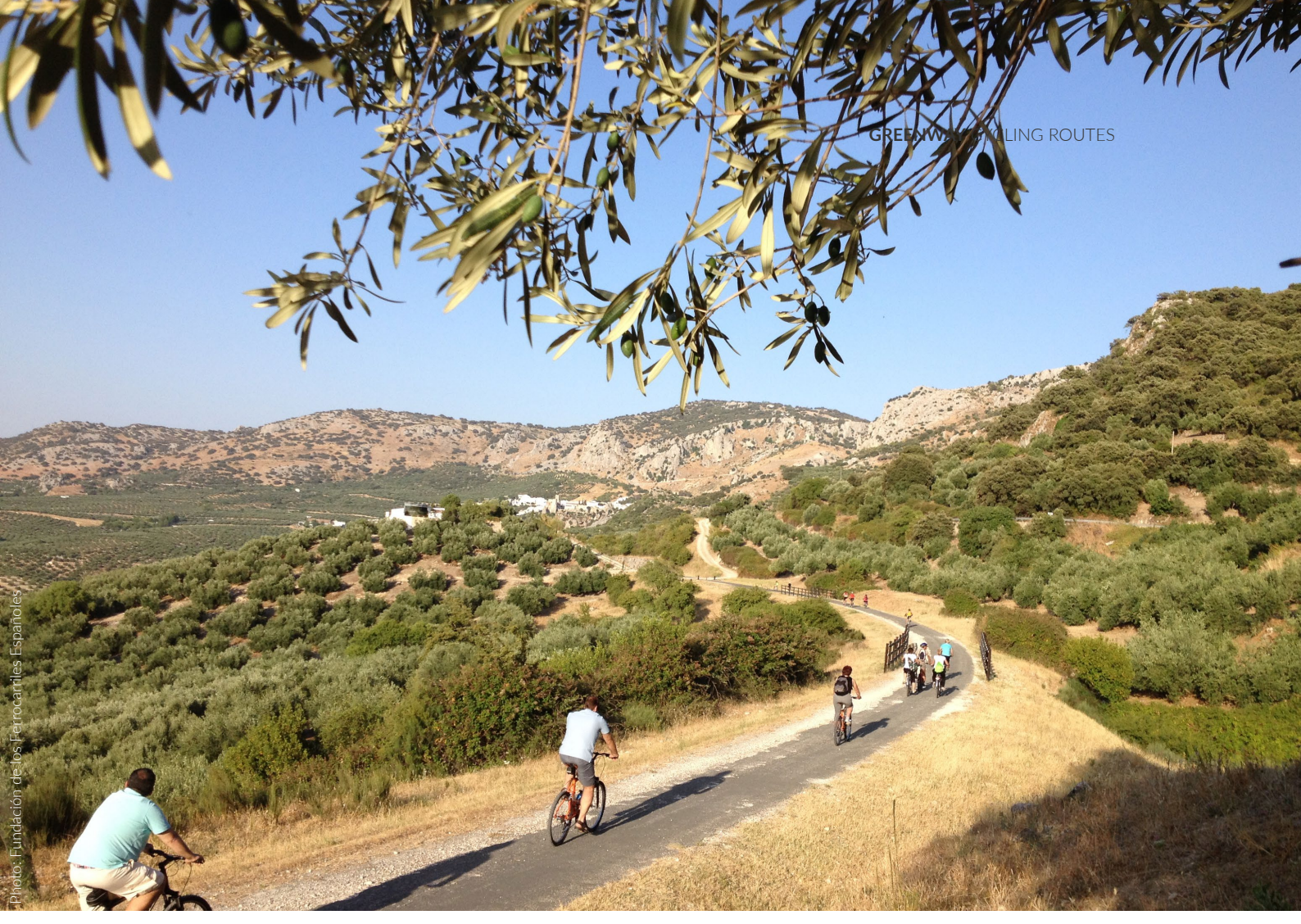
▲ EL ACEITE GREENWAY NATURE TRAIL