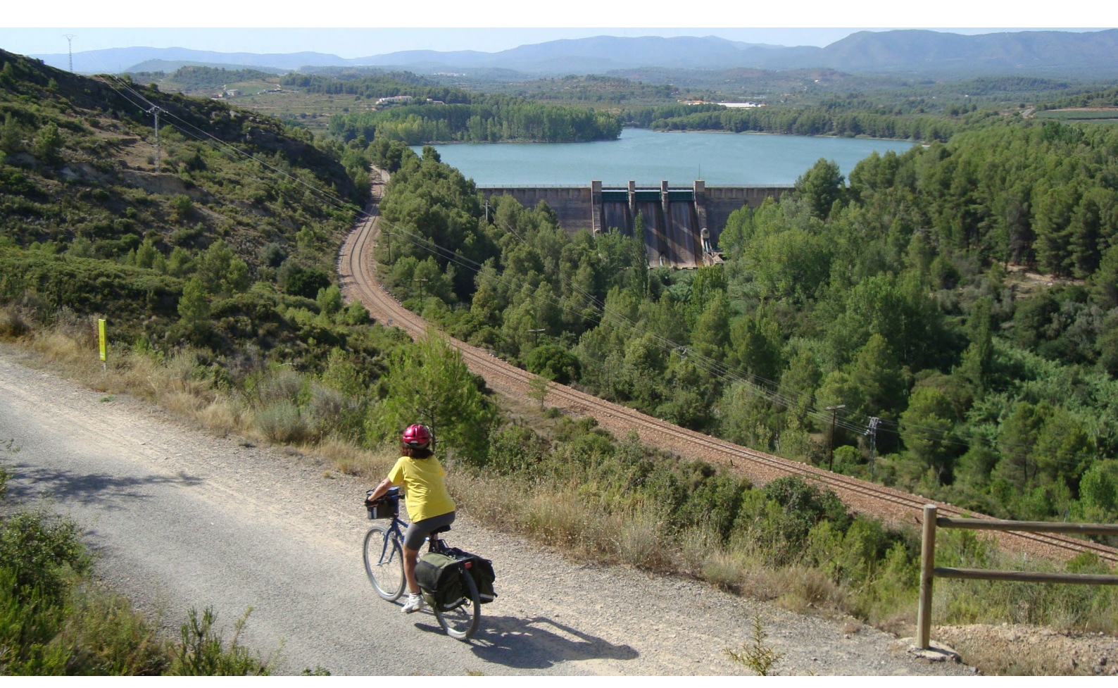
◆ OJOS NEGRO GREENWAY CYCLING ROUTE CASTELLÓN