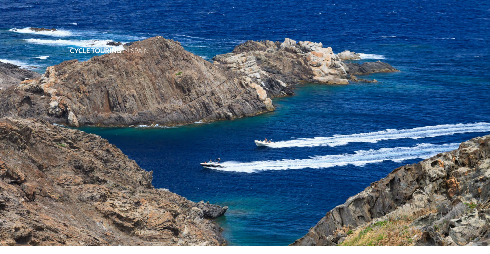
CAPE OF GREUS

The route is 2,000 km long and some sections coincide with the GR routes or shorter distance trails. 35% of the route goesthroughprotected nature areas. You'll be able to discover the wild beaches in the Cabo de Gata-Níjar Nature Reserve and Biosphere Reserve in Almería, look out over the Strait of Gibraltar and visit the picturesque towns and villages in the Alpujarra mountains in the foothills of the Sierra Nevada.