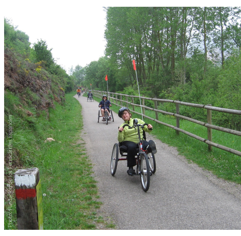
▲ RIVER OJA GREENWAY NATURE TRAIL ▲ LA RIOJA