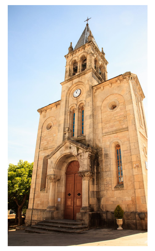
CHURCH OF SANTA MARIÑA SARRIA, LUGO

In Palencia , you can stop off at Terradil los de los Templarios . Its name is a reminder of the presence of the Knights Templar who belonged to one of the most powerful Christian military orders in the Middle Ages.