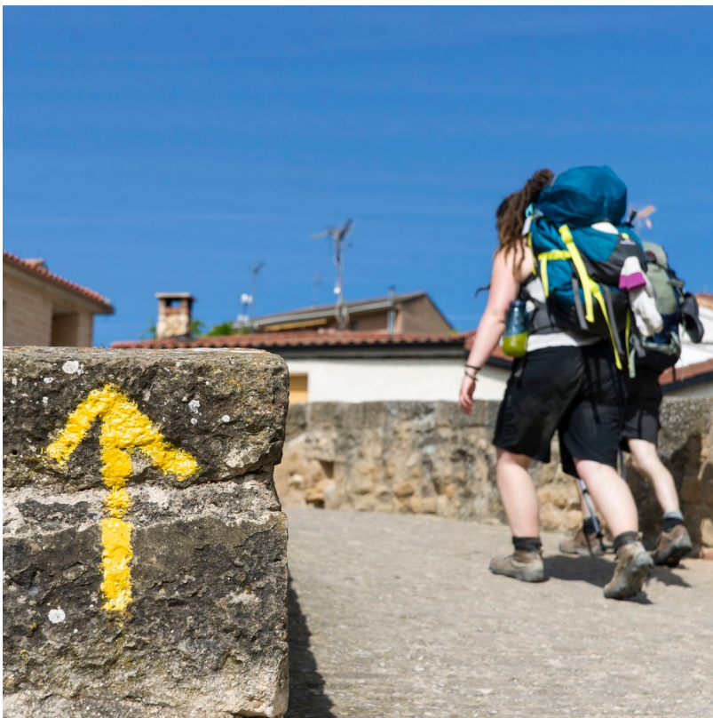
VILLATUERTA BRIDGE NAVARRE

If you decide on this route, and you want to do it all, your adventure will begin in the Pyrenees , before then going along the south side of the Cordillera Cantábrica Mountains until you reach Galicia . You can choose Roncesvalles (Navarre) or Somport (Aragon) as your starting point. These two paths converge at Puente Ia Reina (Navarre). Expect to see beautiful landscapes and enjoy exceptional cuisine en route.