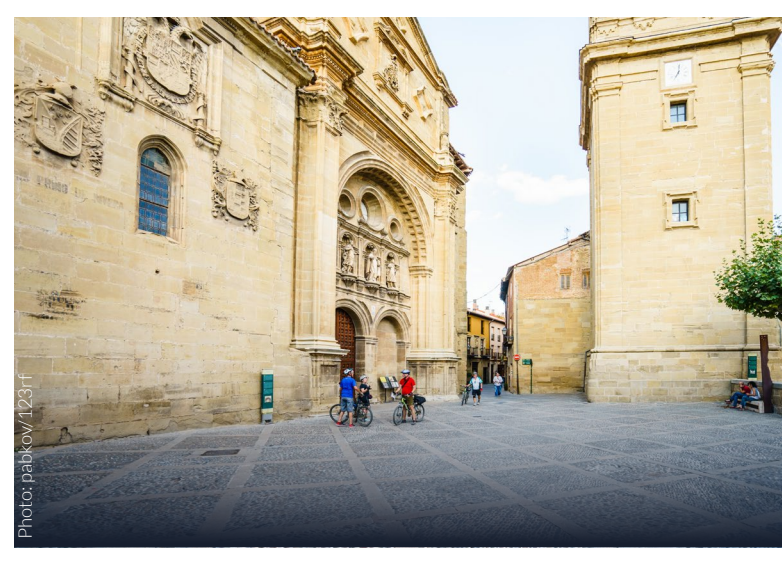
SANTO DOMINGO DE LA CALZADA LA RIOJA

In the Aragon region you will walk through enchanting woods and meadows and see magical places like Canfranc Station and Coll de Ladrones Fortress, in Huesca Province. Also in this province, in the village of Villanúa, you can stop off to visit Las Güixas Cave before reaching Jaca, a district capital where you can rest and stock up with everything you need. Get ready for the next day by treating yourself