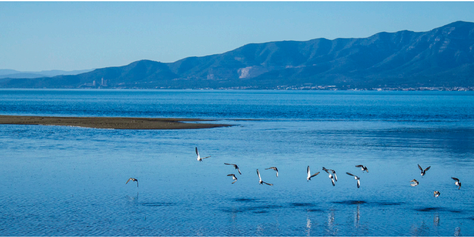
▲ EBRO DELTA TARRAGONA

the Strait of Gibraltar , a bridge between Spain and Africa and where thousands of birds pass each year to spend the spring and summer in Europe after wintering in Africa.