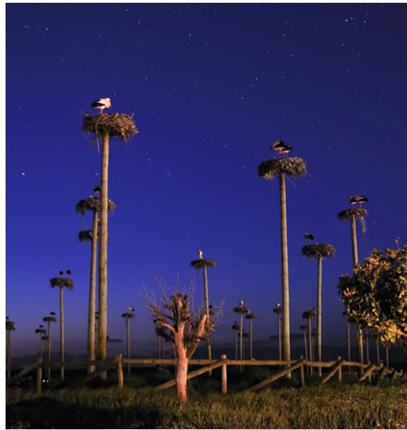
▲ MONFRAGÜE NATIONAL PARK CÁCERES