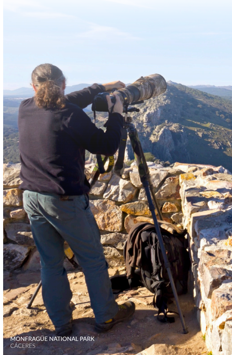
MONFRAGÜE NATIONAL PARK CÁCERES

Volcanoes, beaches, marshlands, deserts and snow-capped mountains are just a few of the environments that await you. The barren, almost lunar appearance of Las Bárdenas Reales contrasts sharply with the lushness of the Irati Forest, both in the province