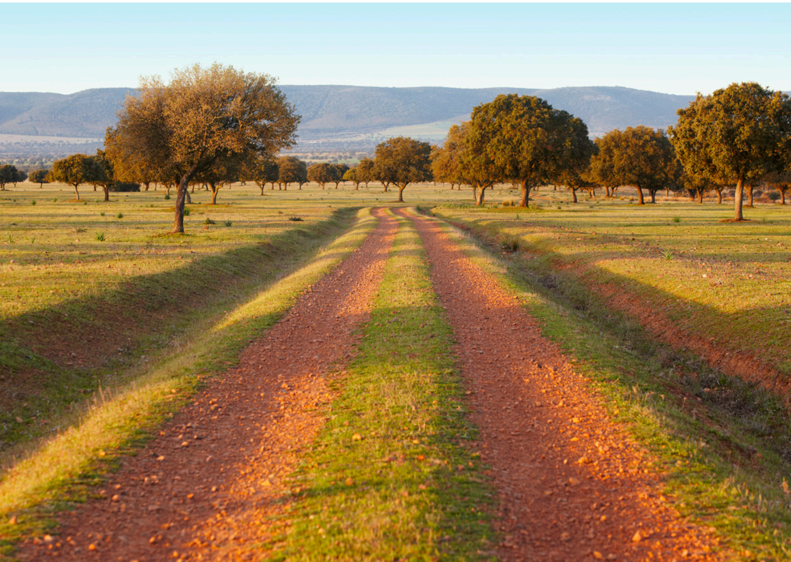
▲ CABAÑEROS NATIONAL PARK CIUDAD REAL - TOLEDO

You'll find the largest herds of these animals in the Montes de Toledo, in Castile-La Mancha. There you have the Cabañeros National Park , with the largest extension of forest and scrubland in the Mediterranean. The park itself organises guided tours in off-road vehicles to bring you to the key rutting locations, and there are also educational tours as well as a route on horse-back.