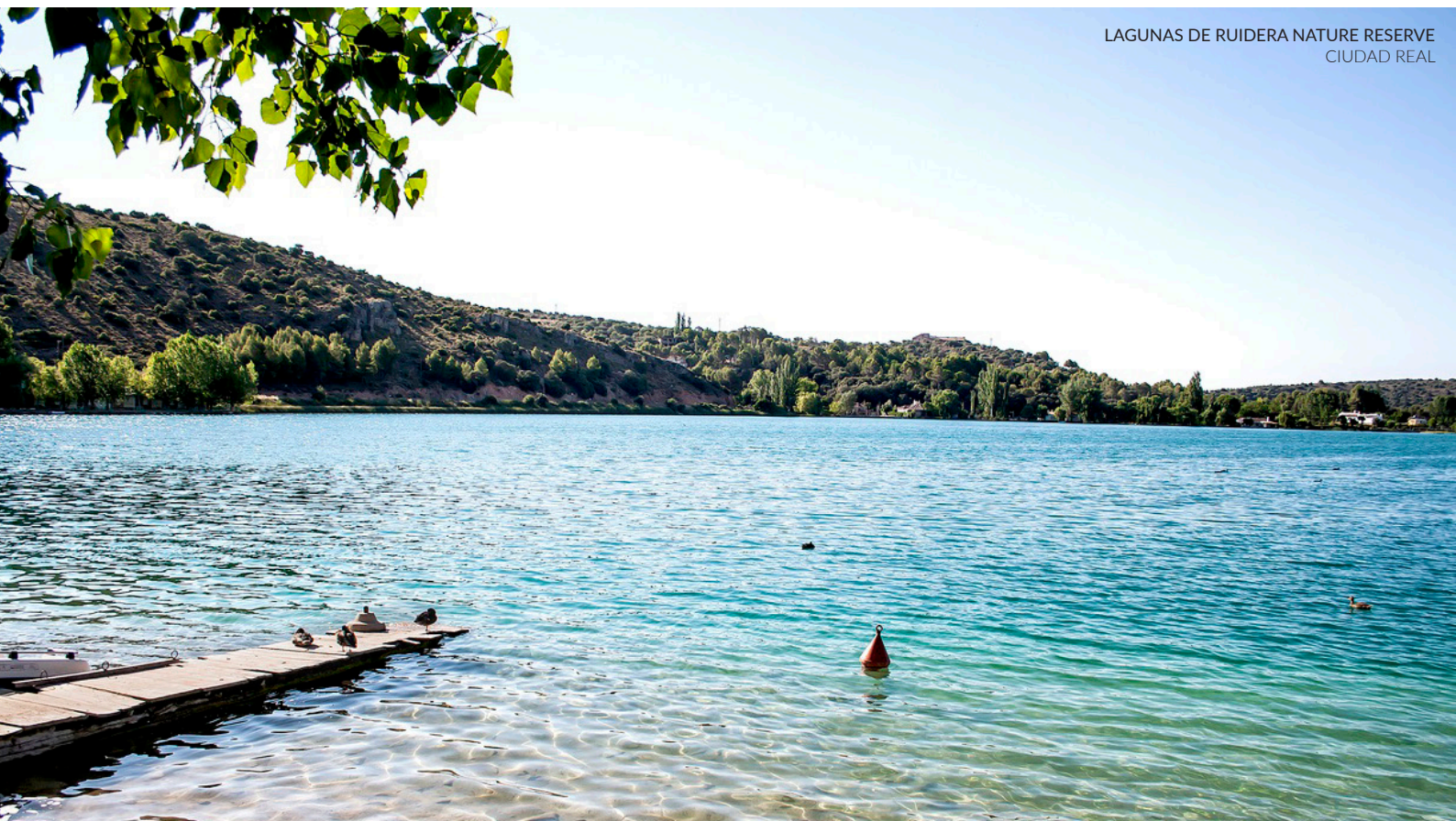
LAGUNAS DE RUIDERA NATURE RESERVE CIUDAD REAL

These are just a few of the amazing experiences you can enjoy in Spain right in the heart of nature.