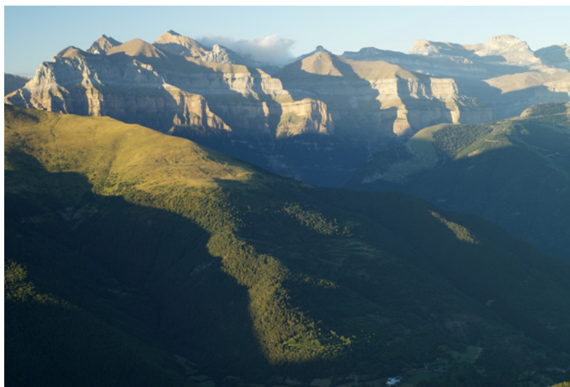
▲ ORDESA Y MONTE PERDIDO NATIONAL PARK HUESCA

Further east you'll find the Conca de Tremp-Montsec basin (Lleida), with an extensive, internationally renowned, geological heritage, and the Central