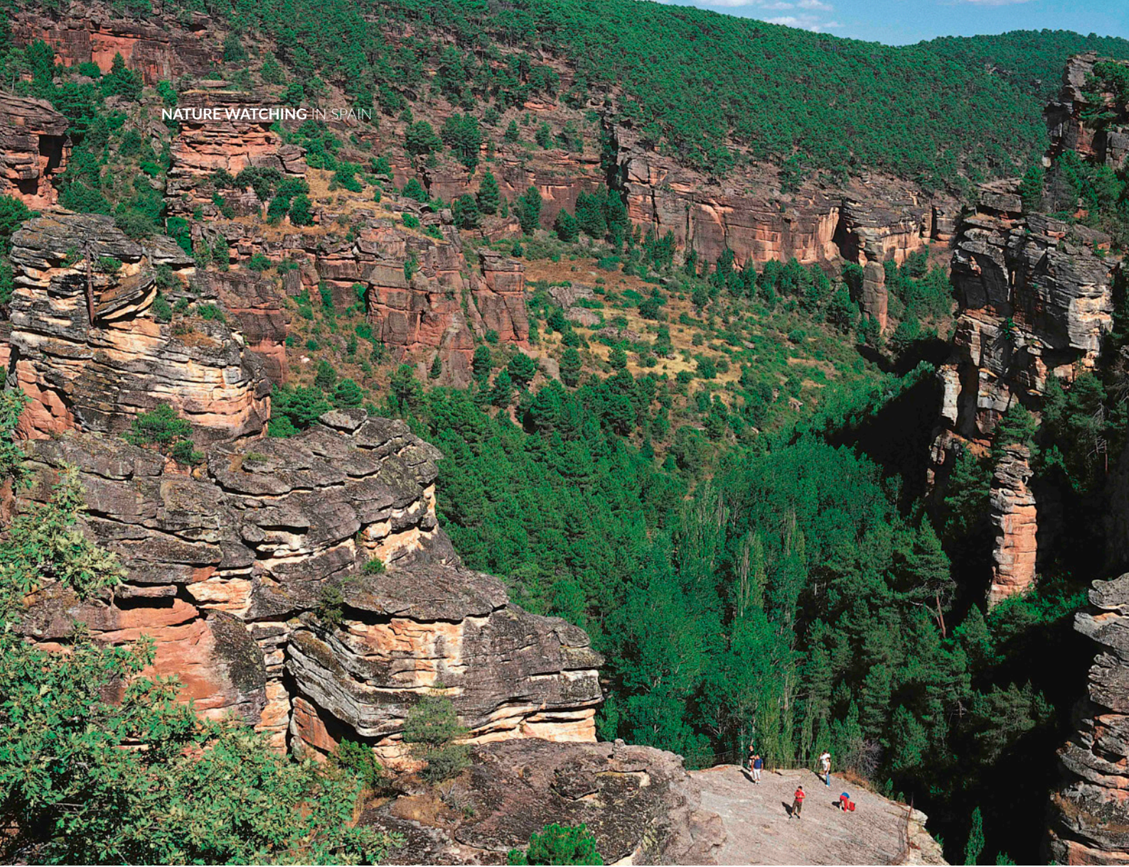
▲ MOLINA - ALTO TAJO GEOPARK GUADALAJARA

The Molina Alto-Tajo (Guadalajara) is the largest geopark in Europe and where you'll find remains of civilisations from ancient times and extraordinary landscapes like the Valle de la Mesa valley and the Ravine of the Virgen de la Hoz. In Extremadura, the Villuercas-Ibores- Jara region is a unique environment where there are numerous trails and itineraries. The abundance of water makes it ideal for sports like canoeing which gives you a thrilling perspective of the magnificent surroundings.