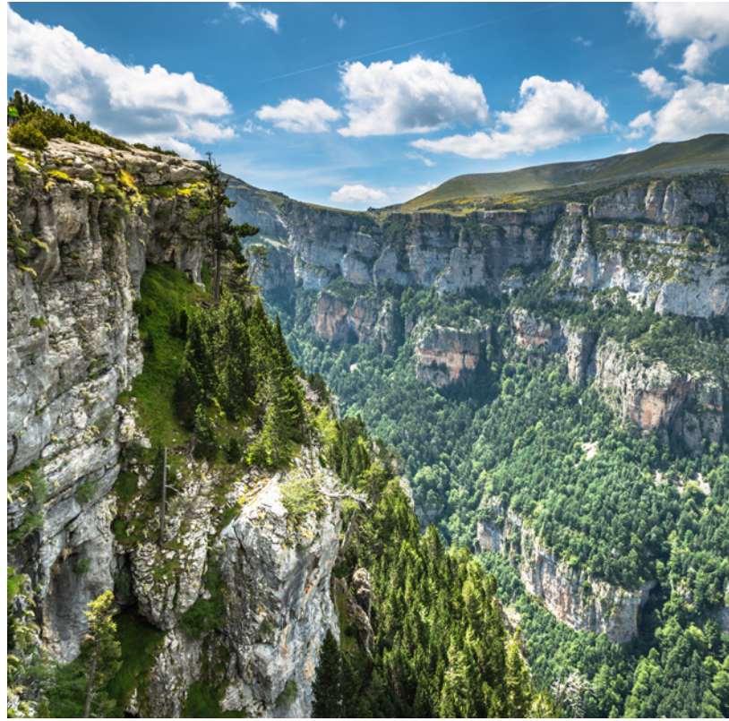
▲ ORDESA Y MONTE PERDIDO NATIONAL PARK HUESCA

Cantabrian sea, the Ebro valley and the Pyrenees makes this region an unbeatable destination for watching rock and forest dwelling birds.