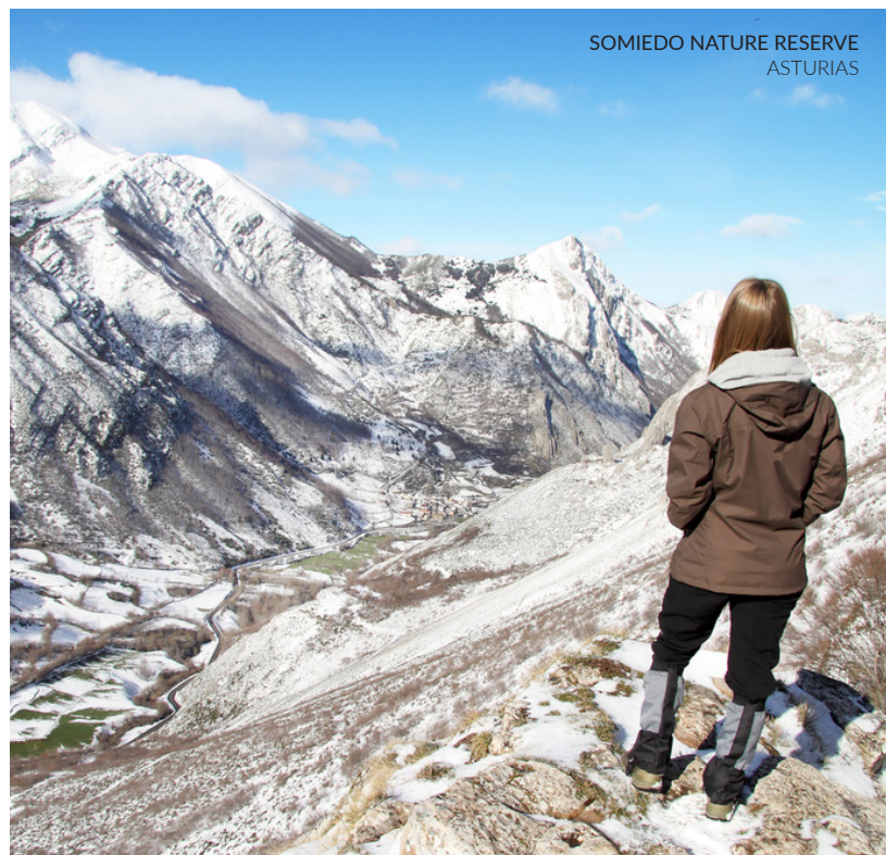
SOMIEDO NATURE RESERVE ASTURIAS