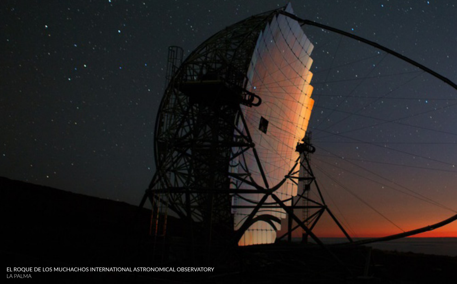
EL ROQUE DE LOS MUCHACHOS INTERNATIONAL ASTRONOMICAL OBSERVATORY LA PALMA

The night sky in Spain provides some of the best conditions in Europe for stargazing. Here there are 16 Starlight destinations, with excellent conditions for observing the starry sky and enjoying tourist activities based on this resource, as well as eight Starlight Reserves.