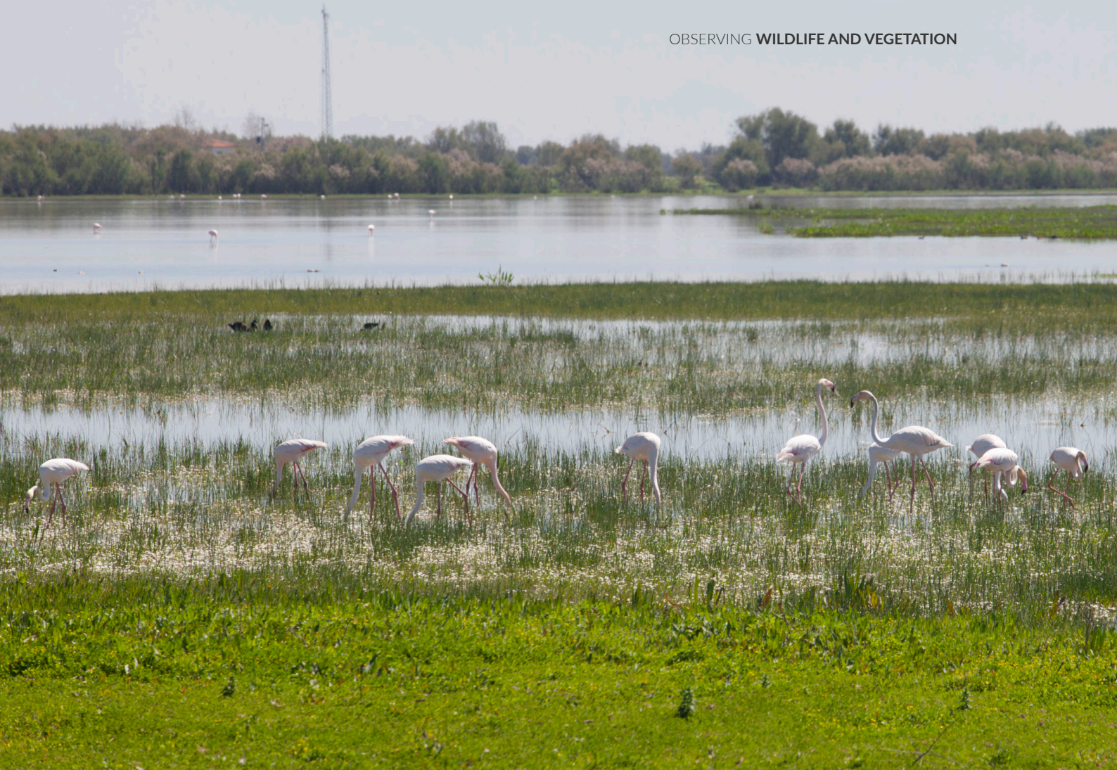
▲ DOÑANA NATIONAL PARK HUELVA

visit the Lagunas de Ruidera Nature Reserve (Albacete and Ciudad Real), nesting areas for red-crested pochards, mallards and purple herons. You can also explore the Hoces del Duratón (Segovia), an amazing landscape where the river has created incredibly-shaped walls and caves. There you can rent a kayak and watch griffon and Egyptian vultures pirouetting across the sky.