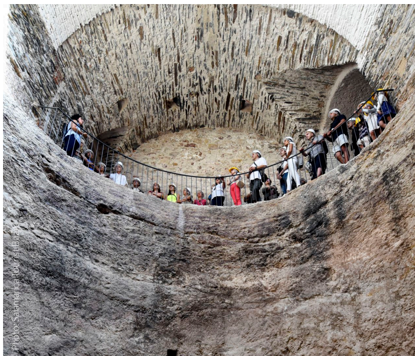
▲ POZO DE NIEVE

You could also look down into the Pozo de Nieve (where they kept snow for making ice) which joins the wall to the remains of the Convent of San Andrés. You could explore the legendary Salamanca