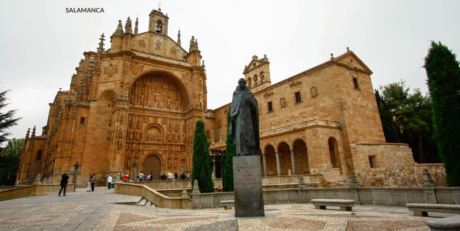
▲ CONVENT OF SAN ESTEBAN