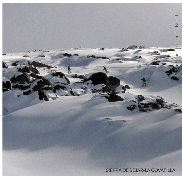
SIERRA DE BÉJAR-LA COVATILLA.

gutters. If you're a fan of skiing, then you ought to know that you're very near the Sierra de Béjar-La Covatilla ski resort.