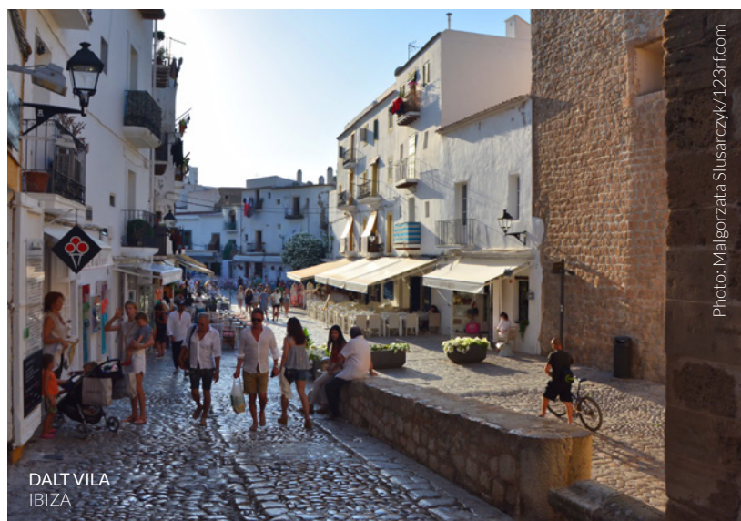
DALT VILA IBIZA