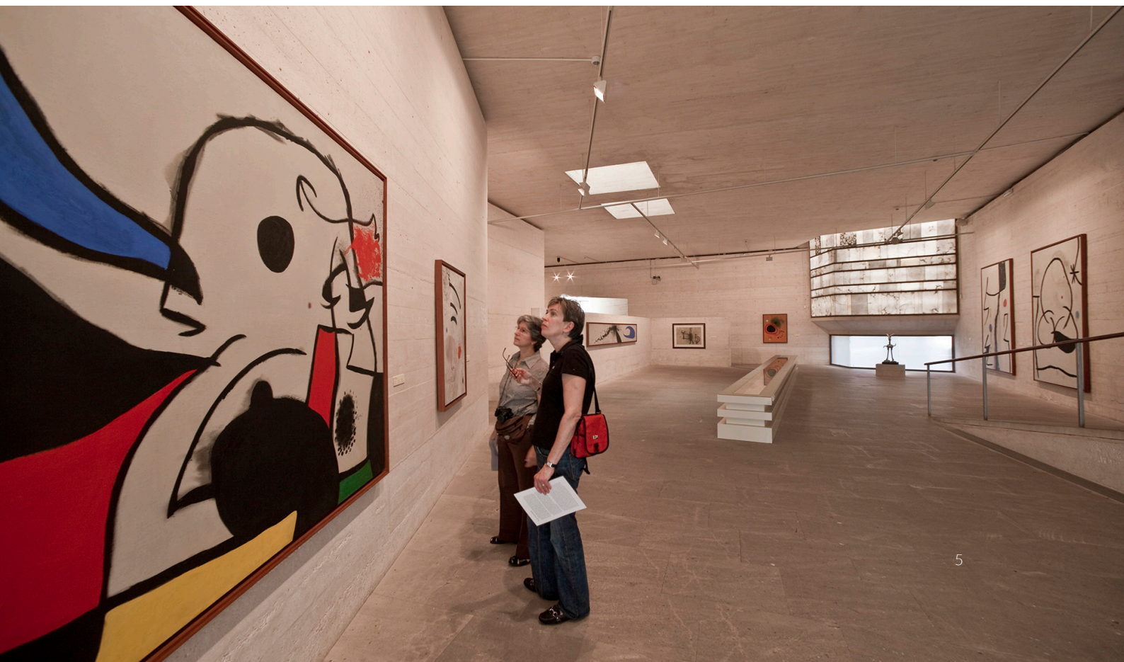
▼ PILAR AND JOAN MIRÓ FOUNDATION MALLORCA

And finally, a travel back in time and visit the Talayots , the settlements built by the islands' first inhabitants. One of the largest and best preserved can be found in the Artà district: Ses Païsses , located in a pretty holm oak forest.