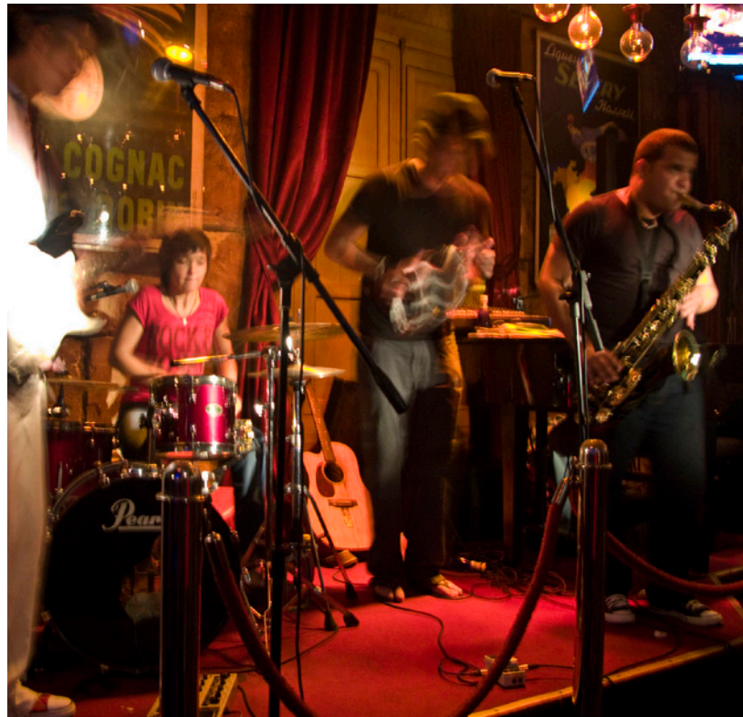
▲ OBERT JAZZ FESTIVAL MENORCA

At this time of year there is a range of activities for sports enthusiasts, including Formentera to run , a sixty-kilometre race which takes in the most beautiful parts of the island (at the end of May/beginning of June). You can also take part in the Formentera-Ibiza Ultrawim , across the 30 km which separate the two islands, combined with two more races of 5 km and 750 m, which usually takes place in May.