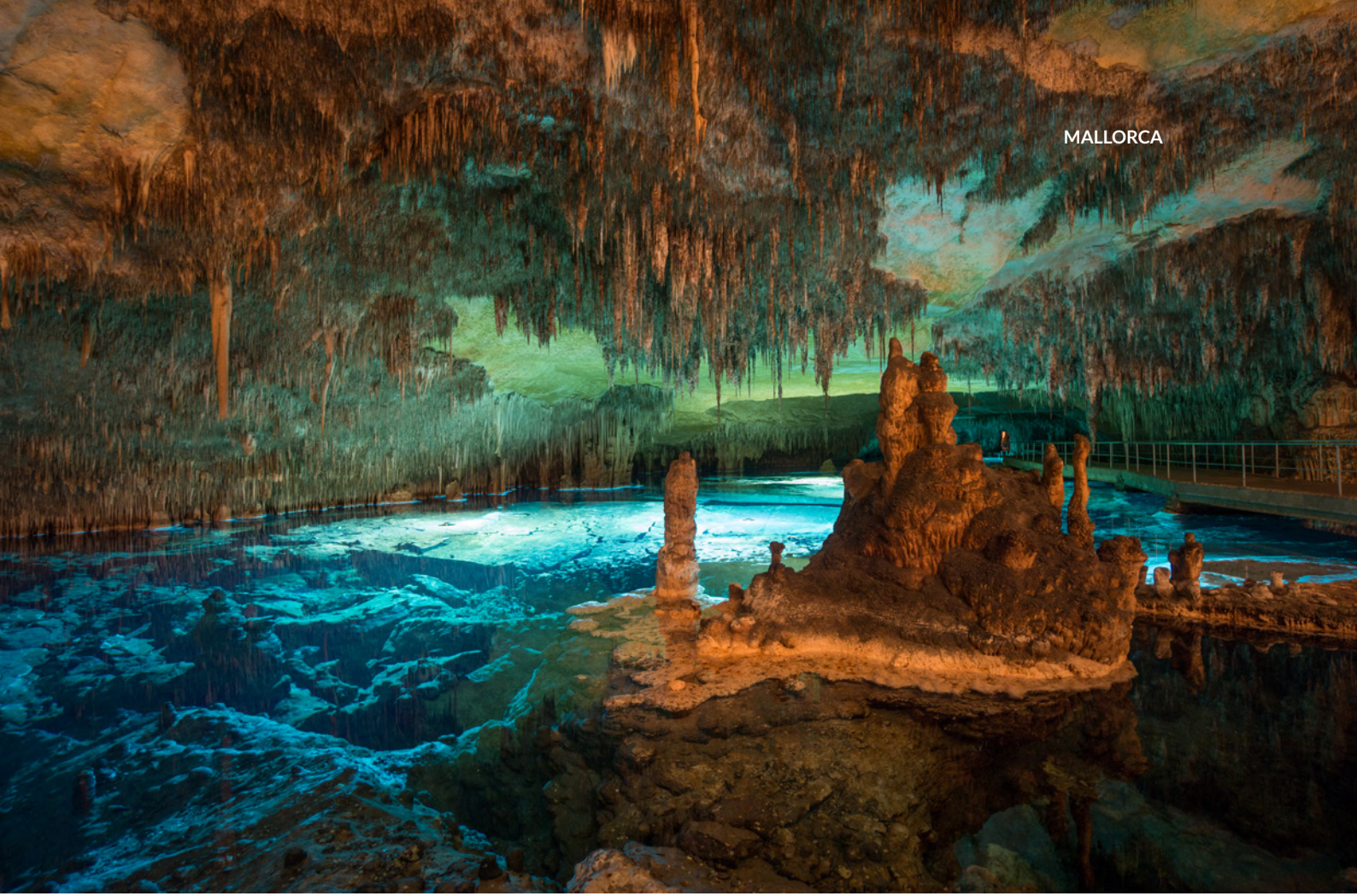
▲ DRACH CAVES, PORTO CRISTO MALLORCA