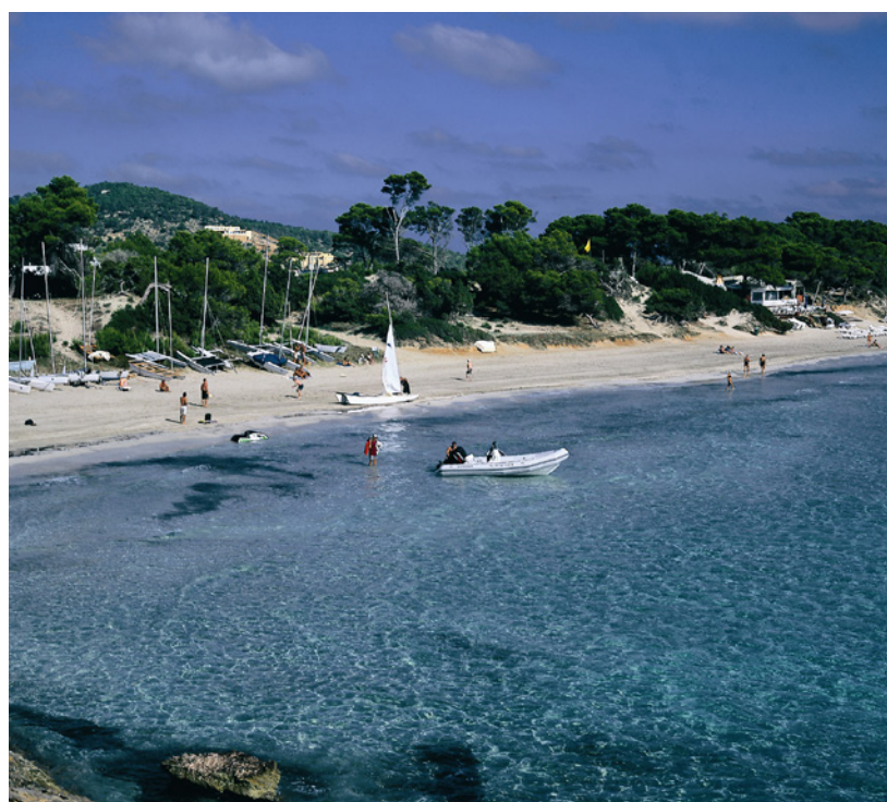
▲ SES SALINES NATURE RESERVE IBIZA

From the beach you get a wonderful view of the islands of Es Vedrà and Es Vedranell in the Cala d'Hort, Cap Llentrisca y Sa Talaia Nature Reserve . This is the perfect place for diving, hiking and mountain-biking.