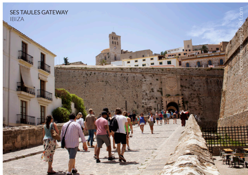
SES TAULES GATEWAY IBIZA

You could enjoy a little creative tourism which is the latest trend in a number of cities throughout the world: you can take part in attractive activities like music, dance, photography, language and culinary workshops.