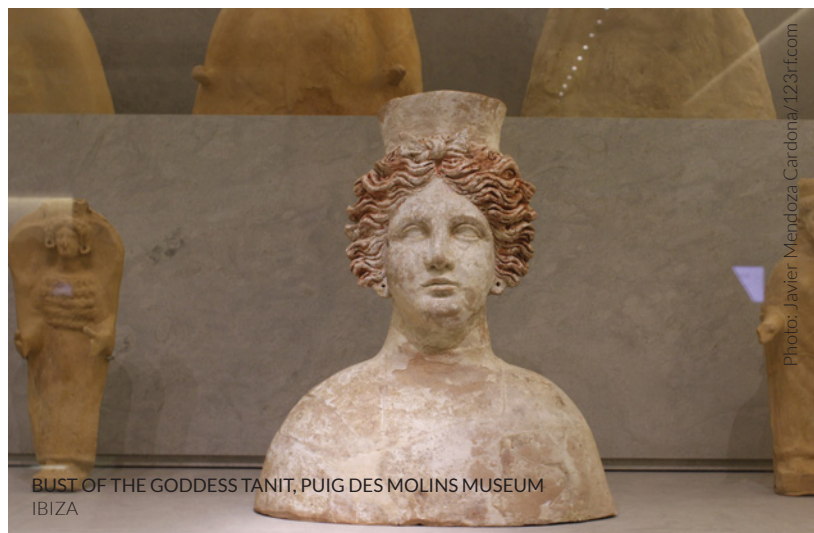
BUST OF THE GODDESS TANIT, PUIG DES MOLINS MUSEUM IBIZA