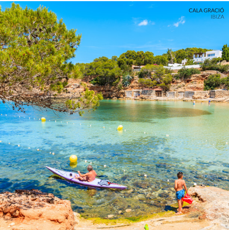
CALA GRACIÓ IBIZA