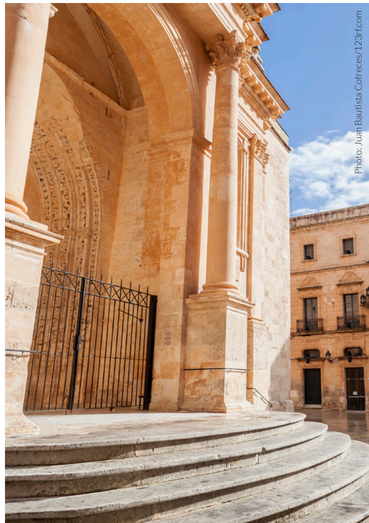
▲ SANTA MARÍA CATHEDRAL CIUTADELLA, MENORCA

In the surrounding area there are megalithic monuments dating back to pre-historic times. You should visit the Naveta des Tudons , a collective Bronze Age tomb which is one of the oldest buildings in Europe.