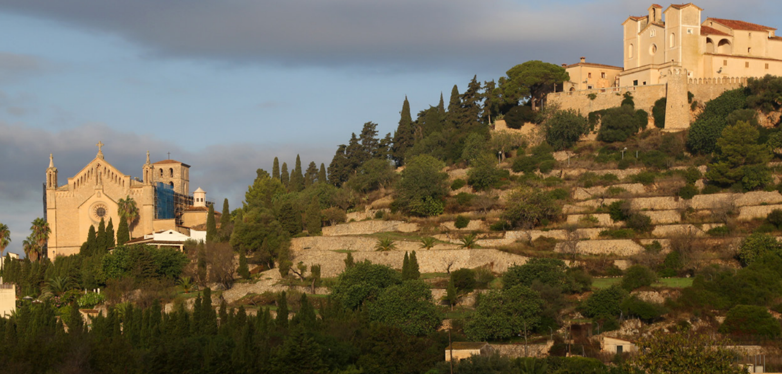
▲ ARTÁ MALLORCA

One of the most attractive outings you can take during your stay in Mallorca is to the natural monument of Torrent de Pareis , a spectacular cliff location. It is an impressive 3-kilometre gorge which leads onto the lovely Playa de Sa Calobra beach. It can be reached on foot or by taking a boat from Port de Sóller .