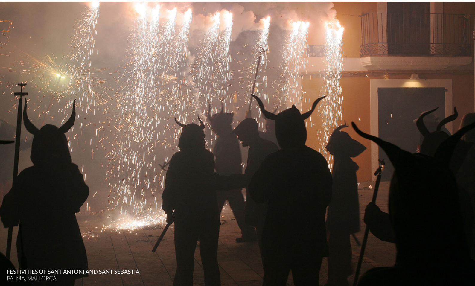
FESTIVITIES OF SANT ANTONI AND SANT SEBASTIÀ PALMA, MALLORCA