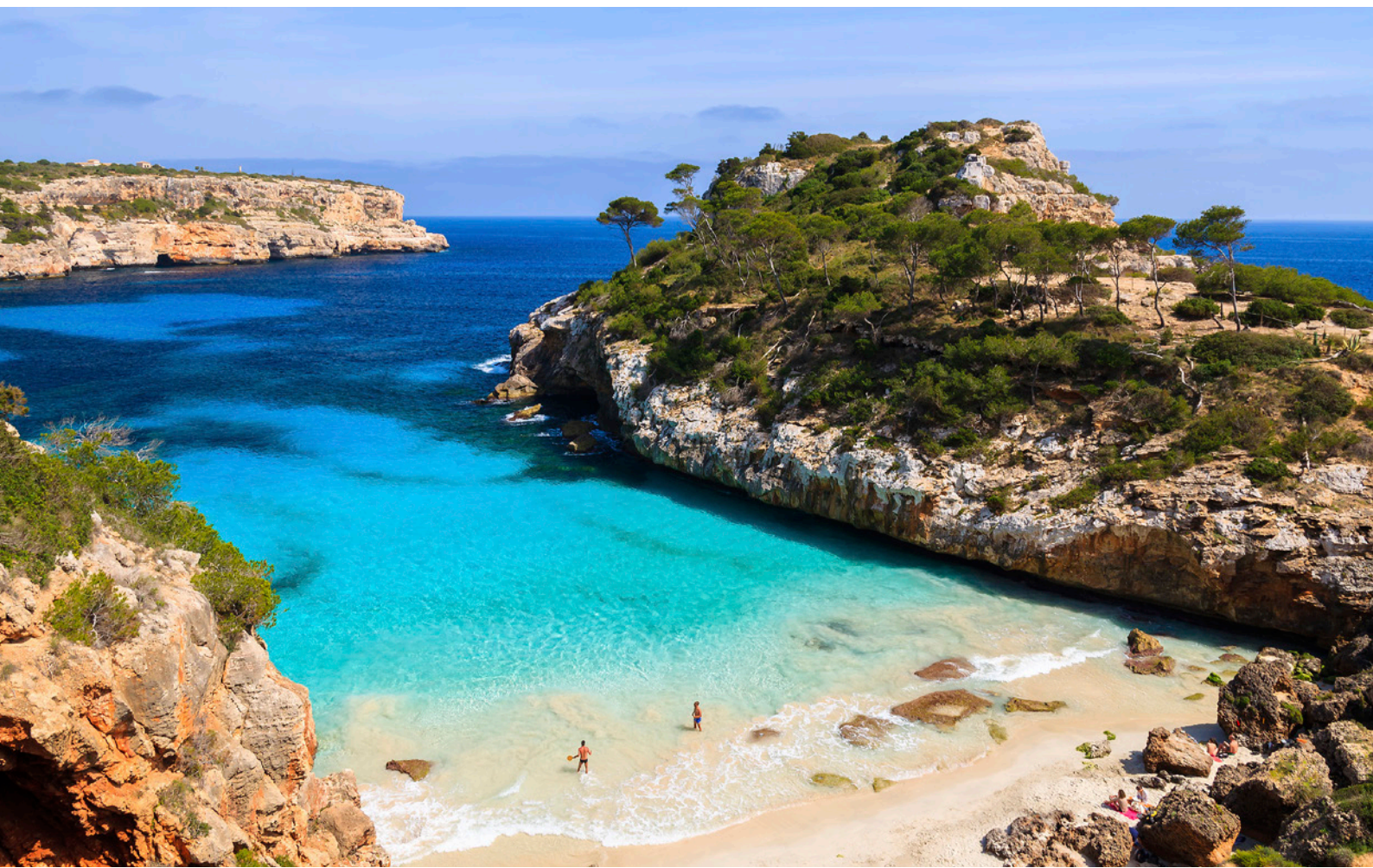
▲ CALÒ DES MORO MALLORCA

Spectacular cliffs, vast unspoiled beaches, delightful coves... Find your favourite beach in the Balearic Islands and enjoy a dream holiday in the crystal-clear waters. Here is a small selection of 10 idyllic locations.