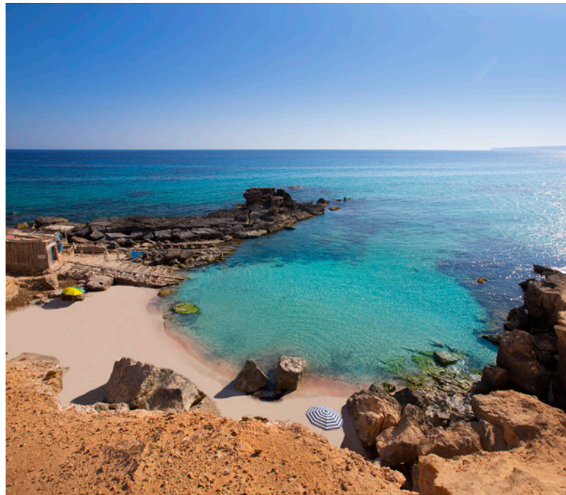
▲ CALÒ D'ES MORT FORMENTERA

The perfect choice for nudists. It is over 300 metres wide and is at the foot of a cliff. You can take a mud bath as if you were at a spa.