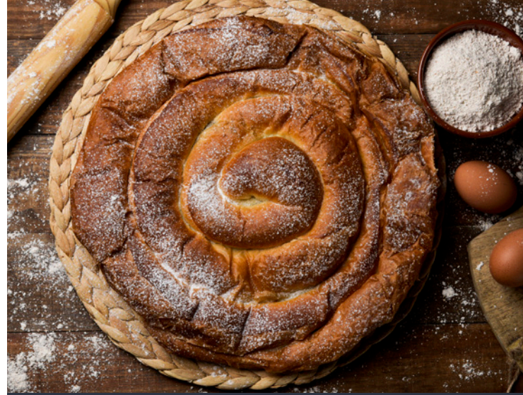
▲ ENSAIMADA MALLORCA

Special mention should go to leather goods , like footwear which are renowned worldwide for their quality. If you're interested in discovering the craft process involved in their production you're best bet is to visit a factory in one of the towns where they are made, like Inca in the Raiguer Region in the centre of the island.