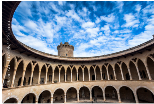
▲ BELLVER CASTLE, PALMA MALLORCA

For a privileged view of the island you should climb up to the Gothic style Bellver Castle , about 3 kilometres from the historical town centre and one of very few round castles in Europe.