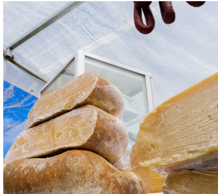
▲ MAHÓN CHEESE MENORCA

In the Ciudadella craft market , also open in the summer and one of the most popular, you'll find just about everything from jewellery and footwear to pottery and illustrations.