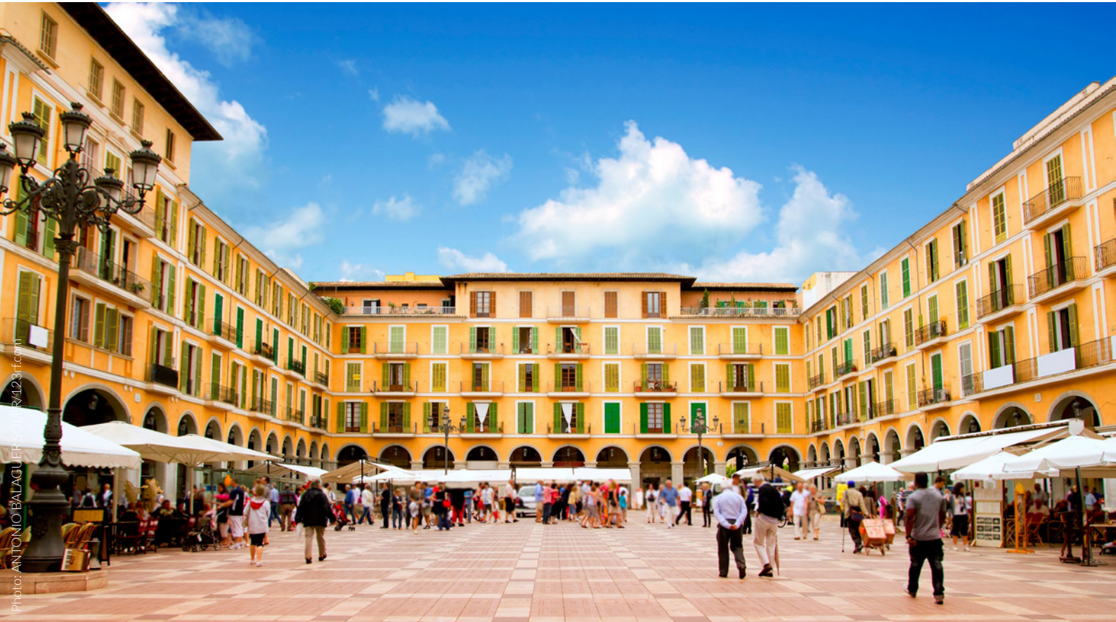
▲ PLAZA MAYOR, PALMA MALLORCA

Nature, sports, beaches, charming villages, underground grottos, a great range of leisure possibilities for families... Mallorca has so much to offer. So what are you waiting for?