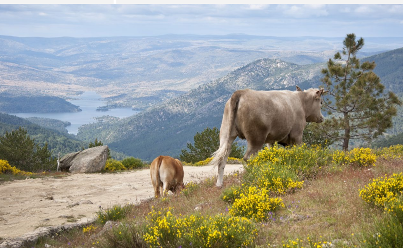
▲ IRUELAS VALLEY NATURE RESERVE ÁVILA