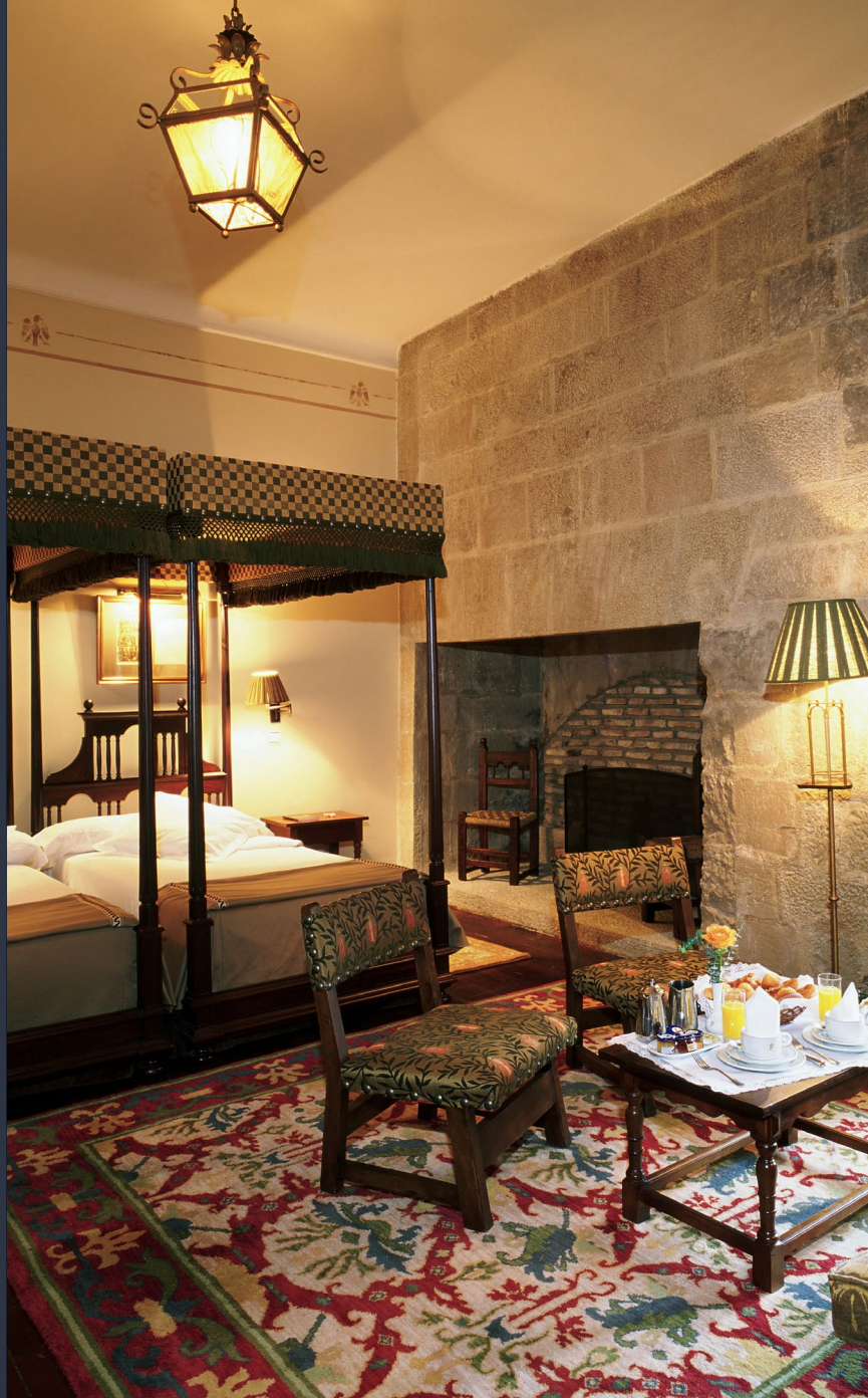
▲ OLITE PARADOR HOTEL NAVARRE

A country house is a fantastic option for enjoying nature with your family. These are often older buildings (farmsteads, mansions, farm houses, farm workers' cottages and mills) which have been refurbished as tourist accommodation with all modern comforts. There you can sleep in incredible natural surroundings and enjoy first-class cuisine. Many of them have their own children's play parks and organise numerous activities for all ages, like walks and excursions by bicycle or on horseback. They are usually located in small towns and villages or outside the built-up areas of the larger cities.