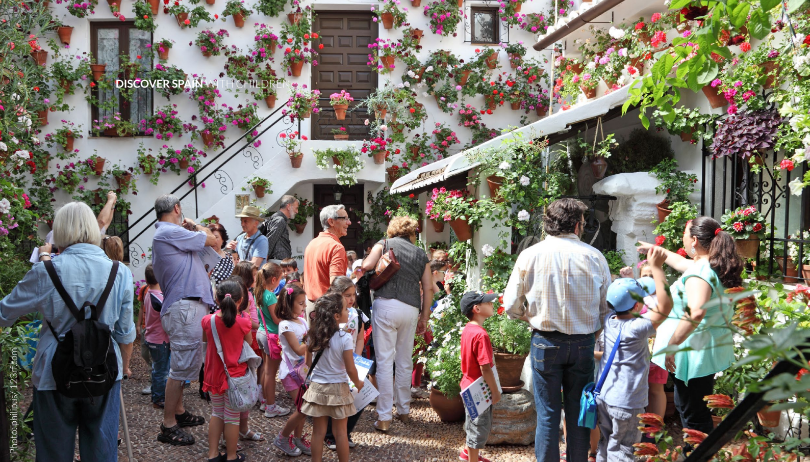
▲ PATIO IN CÓRDOBA CÓRDOBA