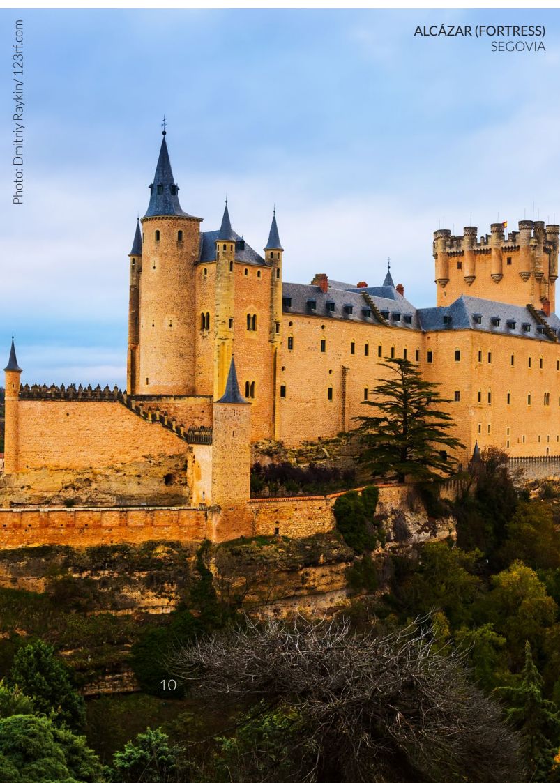
ALCÁZAR (FORTRESS) SEGOVIA