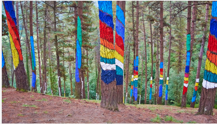
▲ ENCHANTED FOREST OF OMA VIZCAYA

Discover the north of Spain while enjoying natural landscapes of exceptional beauty along the Way of Saint James. The end of the French Route, the most popular, starts in Sarria which is already in Galicia . Divided into six or seven stages, it is the most suitable route for families with children from the age of 10. It is advisable to book your hostel accommodation in advance and to plan your trip as much