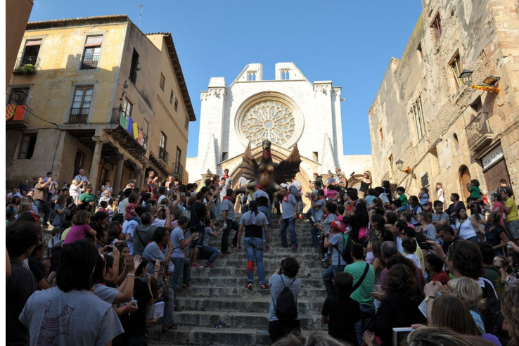
▲ SANTA TECLA CATHEDRAL TARRAGONA