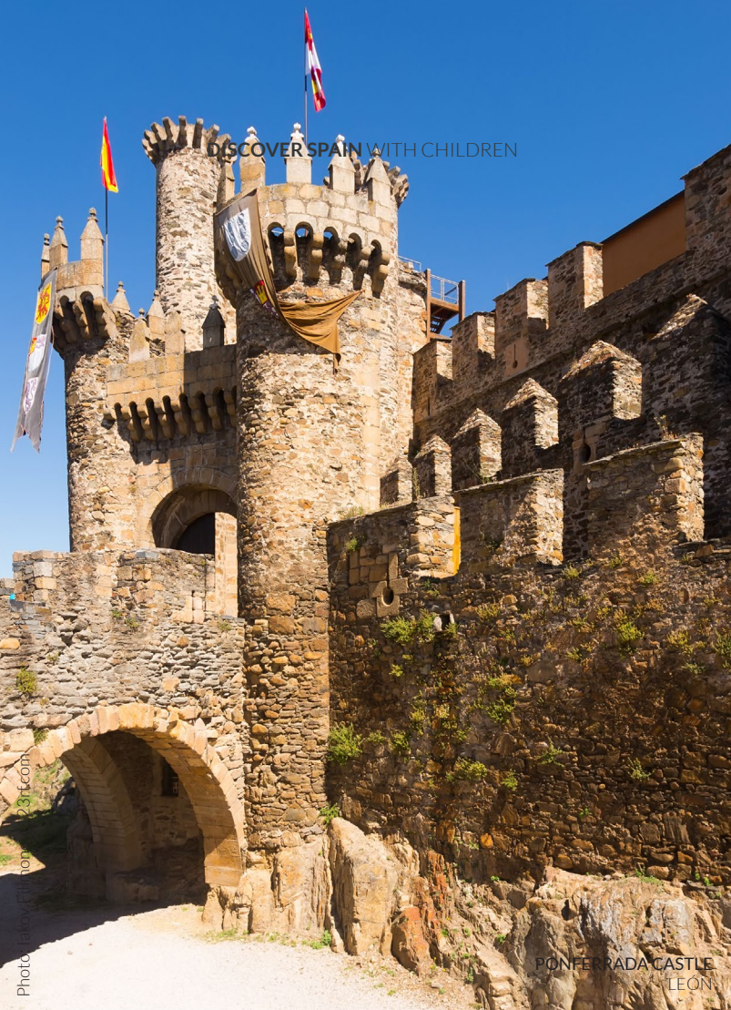
PONFERRADA CASTLE LEÓN